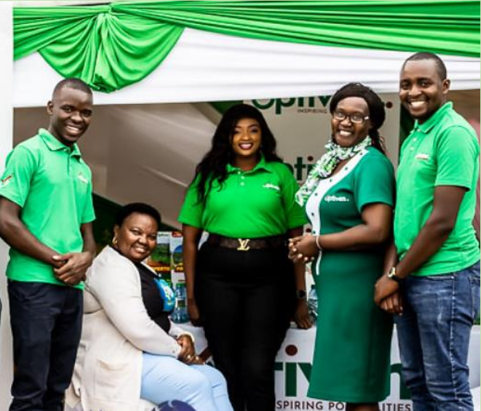
ABOVE : (Left to Right) Optiven Group Director for Strategy poses with staff ahead of the Syokimau Business Expo that was sponsored by Optiven at Destiny Life Church.