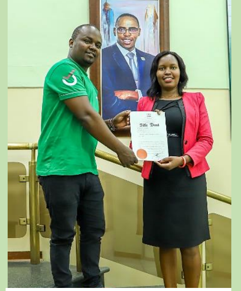
General ABOVE: #OptivenTeamAbsa's Senior Sales the Optiven Absa Offices.