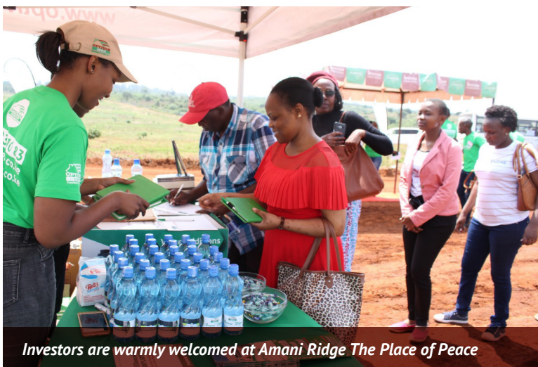
Investors are warmly welcomed at Amani Ridge The Place of Peace

Amani Ridge - the place of peace is a unique and extremely posh, leafy place for you as you seek to realize your desire to live in extremely peaceful surroundings and experience scenic, clean and beautiful environment. It is exclusively meant for you as you pursue real and guaranteed quality life for both self and family. Amani Ridge is a Jewel for a chosen few. It is a place of peace.