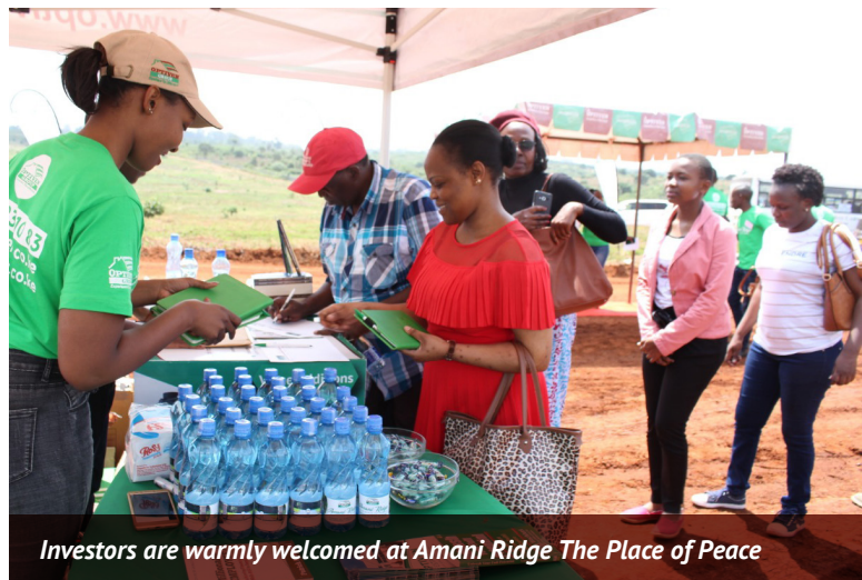
Investors are warmly welcomed at Amani Ridge The Place of Peace

A mani Ridge - the place of peace is a unique and extremely lush, leafy place for you as you seek to realize your desire to live in extremely peaceful surroundings and experience scenic, clean and beautiful environment. It is exclusively meant for you as you pursue real and guaranteed quality life for both self and family. Amani Ridge is a Jewel for a chosen few. It is a place of peace.