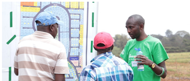
An Optiven Staff takes investors through the Amani Ridge master plan