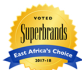
Superbrands East Africa 2017 - 2018

Optiven's flagship product is Value Added Plots, which are particularly enhanced to suit immediate residential settlement, commercial purposes and futuristic capital gain. Optiven is a one-stop shop offering a two-step model for home ownership solutions to its customers.