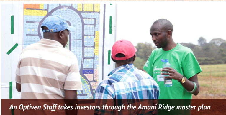
An Optiven Staff takes investors through the Amani Ridge master plan