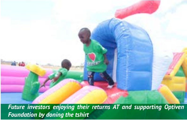
Future investors enjoying their returns AT and supporting Optiven Foundation by doing the tshirt