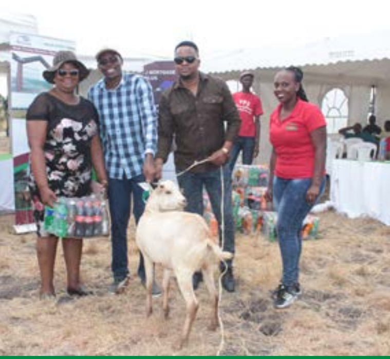
Soda on the left... mbuzi on the right... hii ni Easter bila stress.