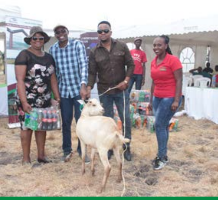
Soda on the left... mbuzi on the right... hii ni Easter bila stress.