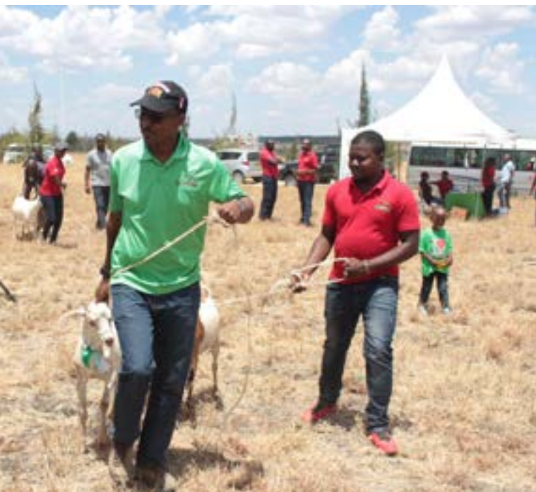
The power of co-operation saw the mbuzis following in the footsteps of Optiven