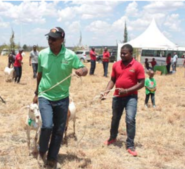
The power of co-operation saw the mbuzis following in the footsteps of Optiven