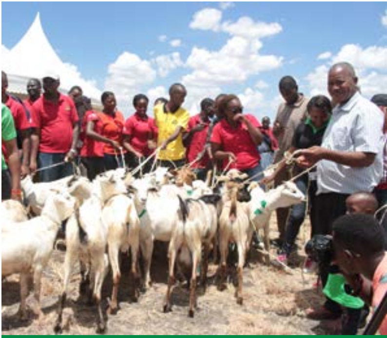
Kila mtu na mbuzi wake.... The Optiven Army linking Mbuzi Meeeh to their owners at Victory Gardens