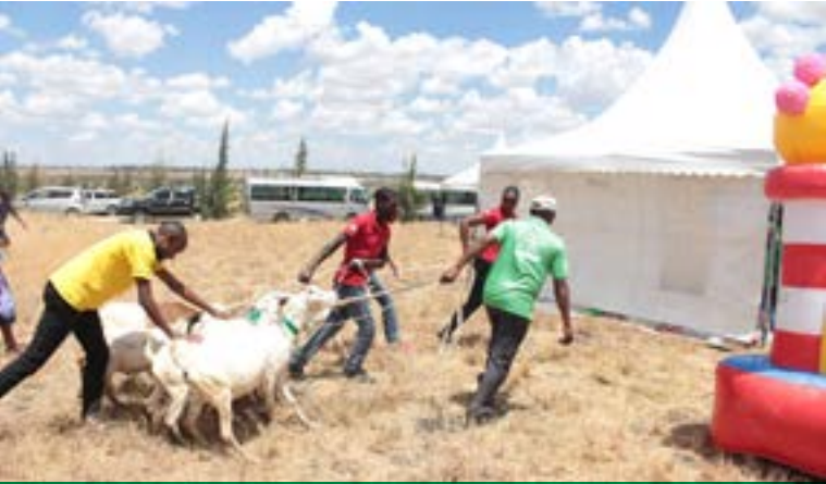
When it is time to go, we all pull together. Team Optiven taking their mbuzis where they belong.