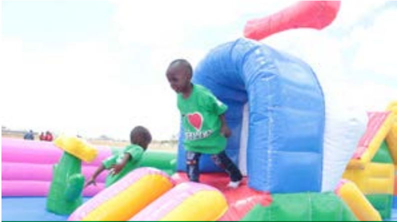
Future investors enjoying their returns AT and supporting Optiven Foundation by doing the tshirt