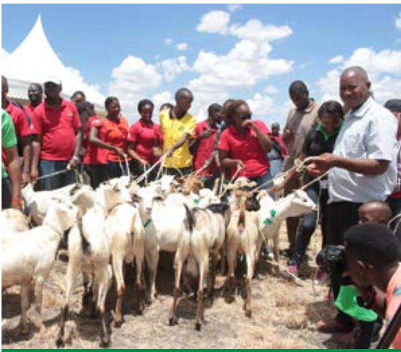
Kila mtu na mbuzi wake.... The Optiven Army linking Mbuzi Meeeh to their owners at Victory Gardens