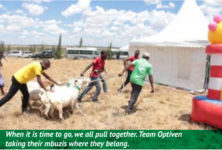
When it is time to go, we all pull together. Team Optiven taking their mbuzis where they belong.