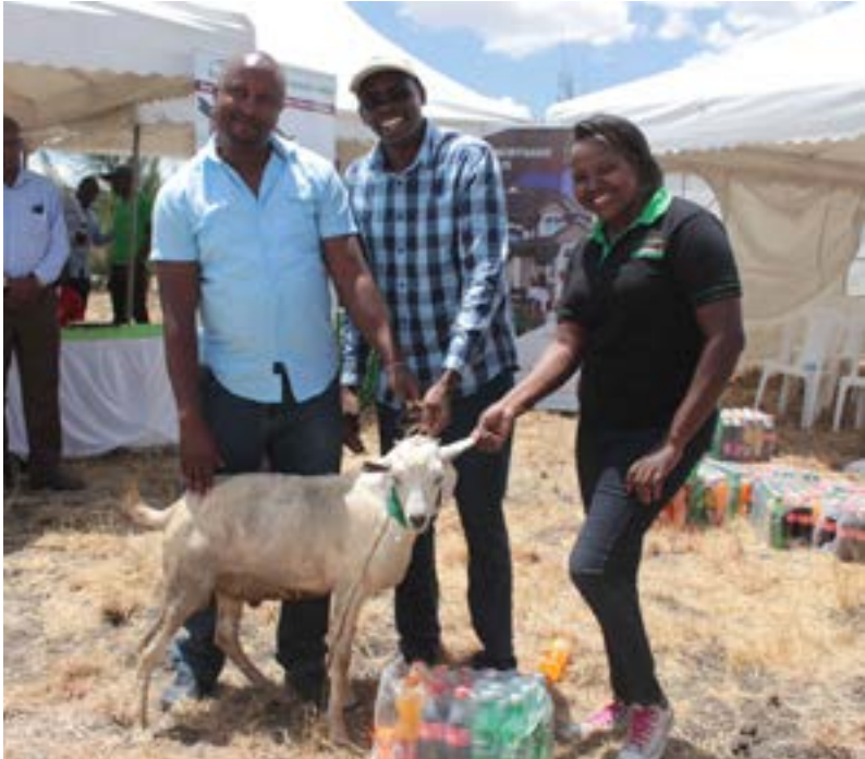
And the celebrations were just beginning.... Fun ... Fun .... Fun