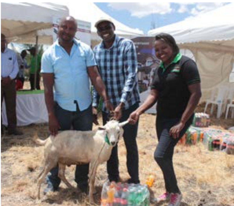
And the celebrations were just beginning.... Fun ... Fun .... Fun