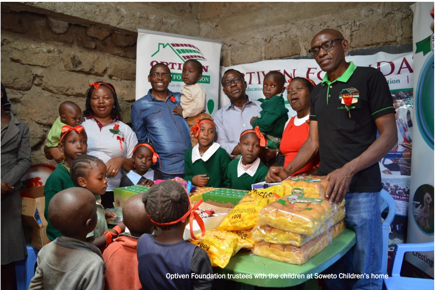
Optiven Foundation trustees with the children at Soweto Children's home