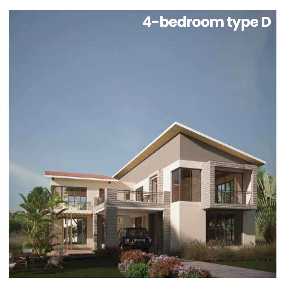
Ground Floor (142.2 sqm.)