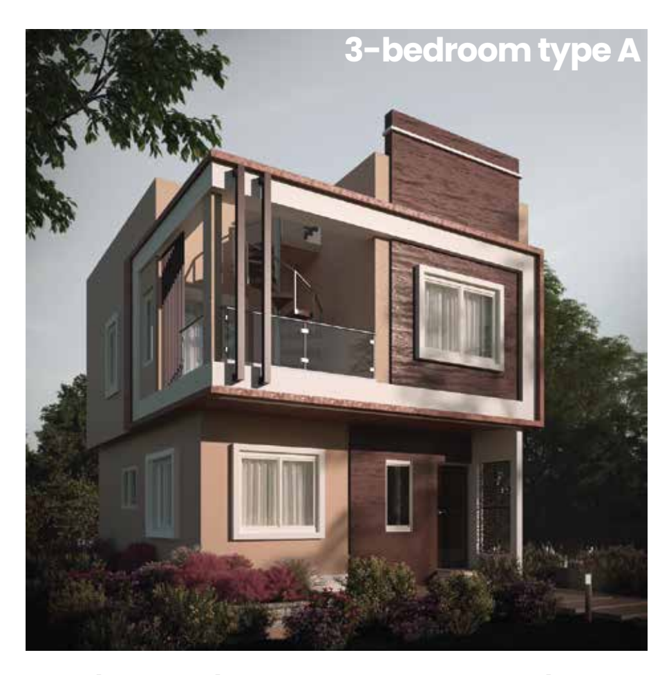
Ground Floor (43.1 sqm.)