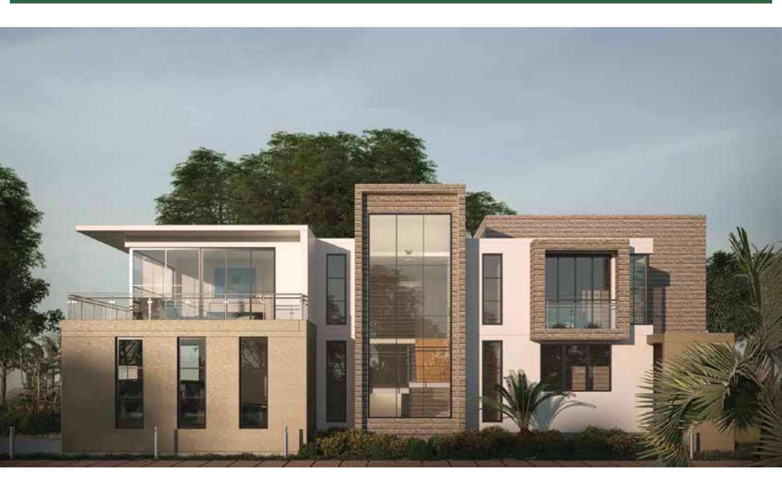
Ground Floor (205.2 sqm.)