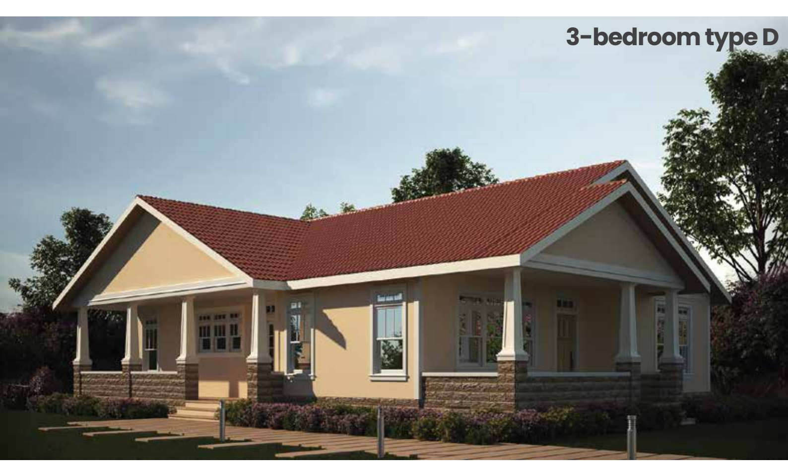
Ground Floor (146.5 sqm.)