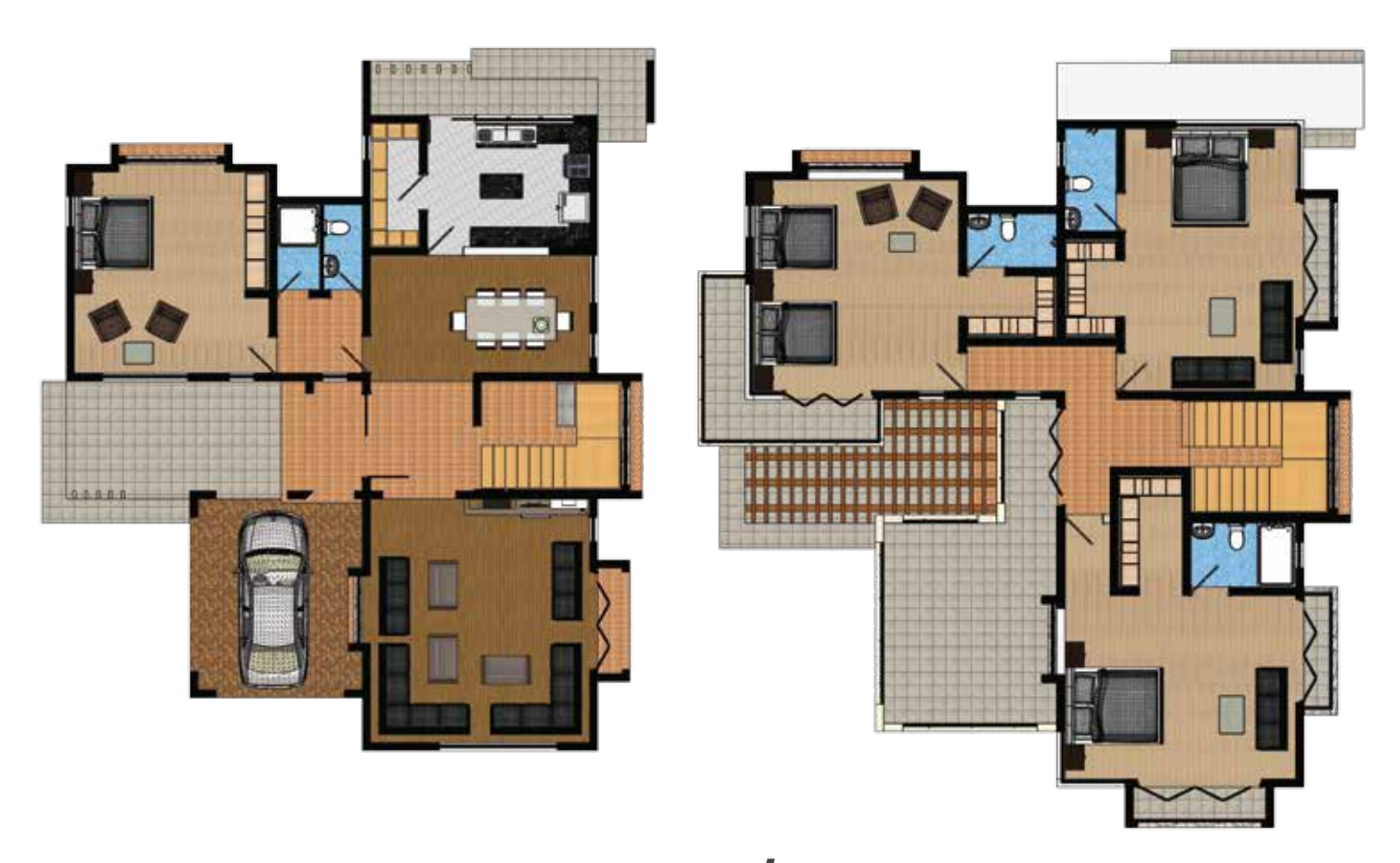
First Floor (109.6 sqm.)