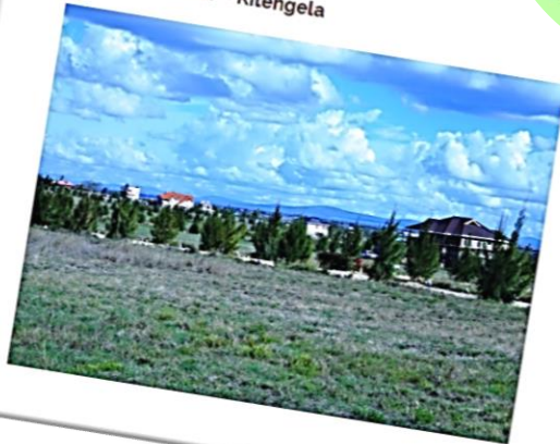
Victory Gardens – Kitengela