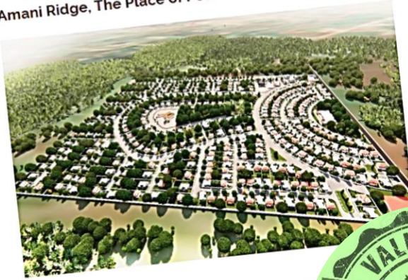
Amani Ridge, The Place of Peace – Kiambu