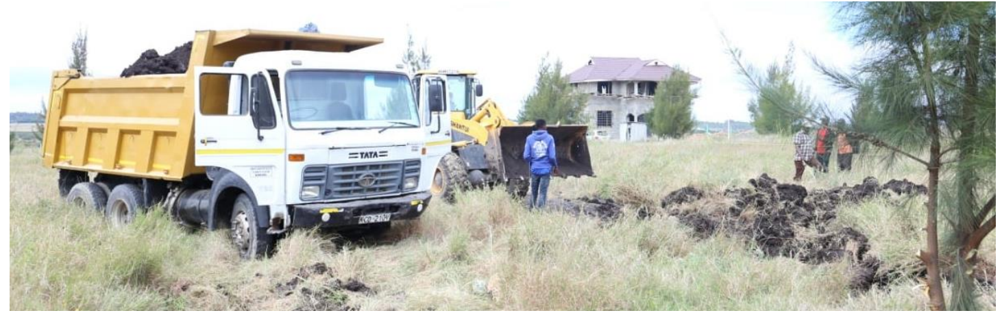
ABOVE: A proud investor ground breaks for their new home at Optiven's Victory Gardens in Kitengela. Homes on the project in the background

Customers sample the water installed at premier project Victory Gardens Kitengela by Optiven. "We can all embrace feedback as a stepping stone to better meet our customers expectations. This is because feedback stems upto growth.". He made the remarks ahead of launching the Customer Service Week for 2020. The