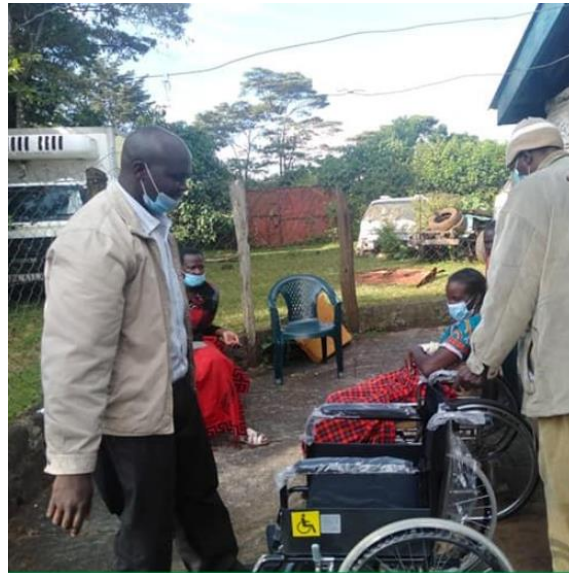
ABOVE: Beneficiaries of a wheelchair courtesy of the Optiven Foundation celebrate the gift in November 2020