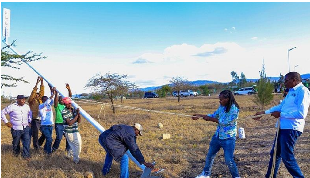
ABOVE: Engineers on site at Garden on Joy, installing the solar powered street lights all over the project

2. Improved Insulation: Heating and cooling homes accounts for most a home's energy expenditure. Proper insulation plays a major role in vastly reducing the amount of energy and money needed to keep a home comfortable. Trying to insulate an older home cost tens of thousands of dollars, but almost all new homes have modern insulation to ensure they remain comfortable while reducing energy usage.