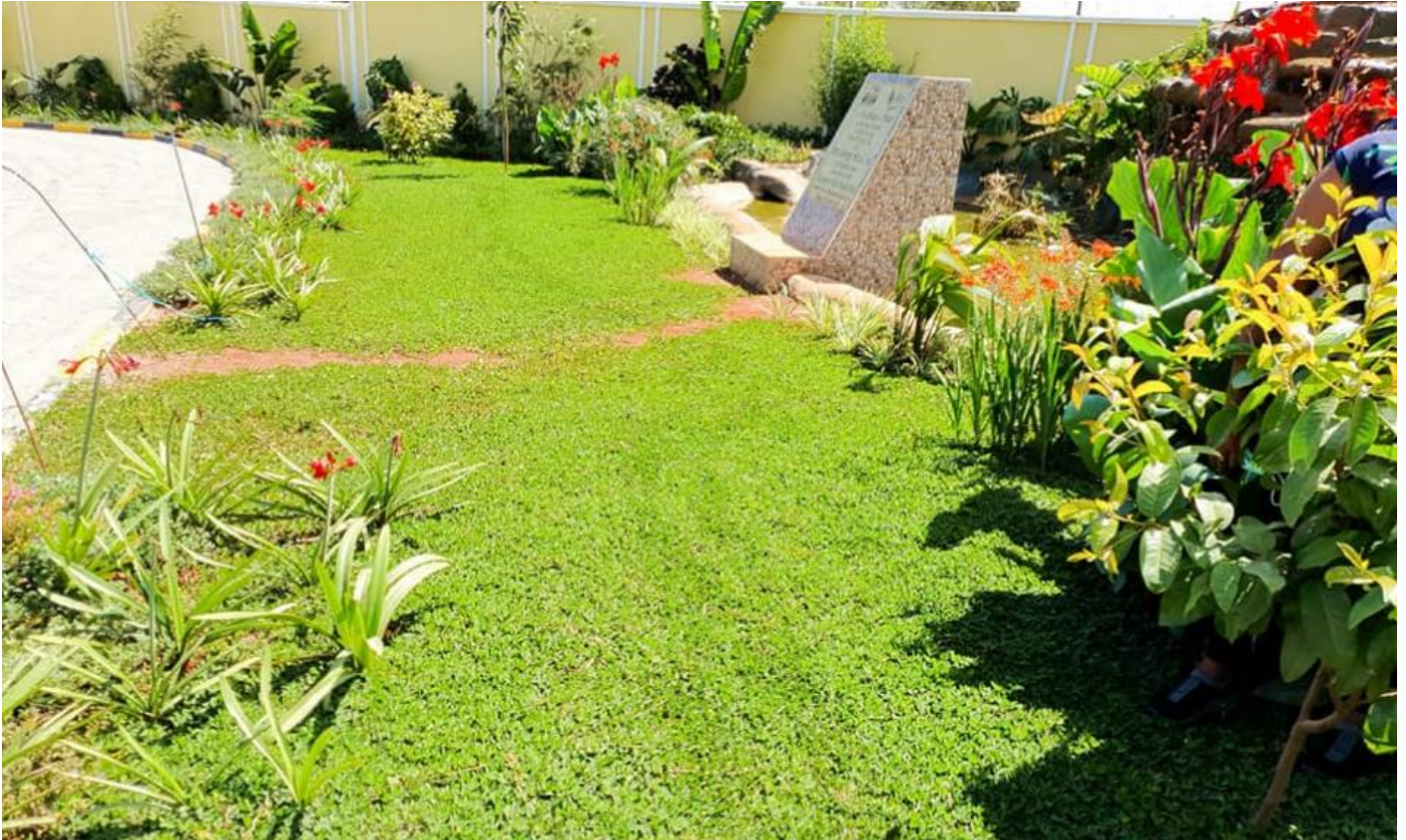
ABOVE: Amani Ridge | The Place of Peace by Optiven as it appears after continuous greening initiatives by Optiven Real Estate