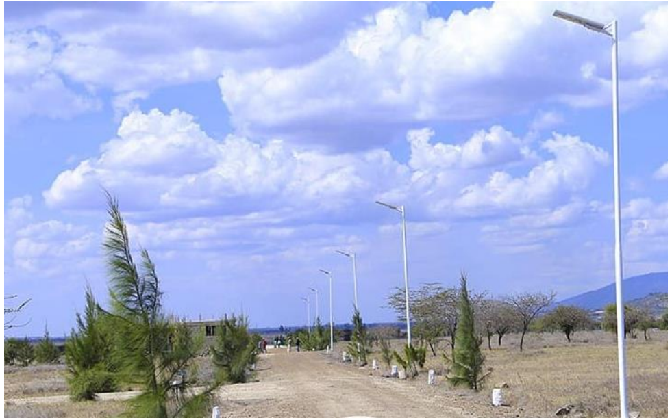
ABOVE: Garden of Joy in Machakos is the latest project under the Optiven Portfolio to be installed with solar powered street lights.

8. Cool Roofs: Builders have designed every aspect of their homes to make life comfortable and easy for homeowners, including roofs. Changes in building materials have resulted in roofs that reflect heat and light away from the home, increasing the overall efficiency of the home's heating and cooling system.