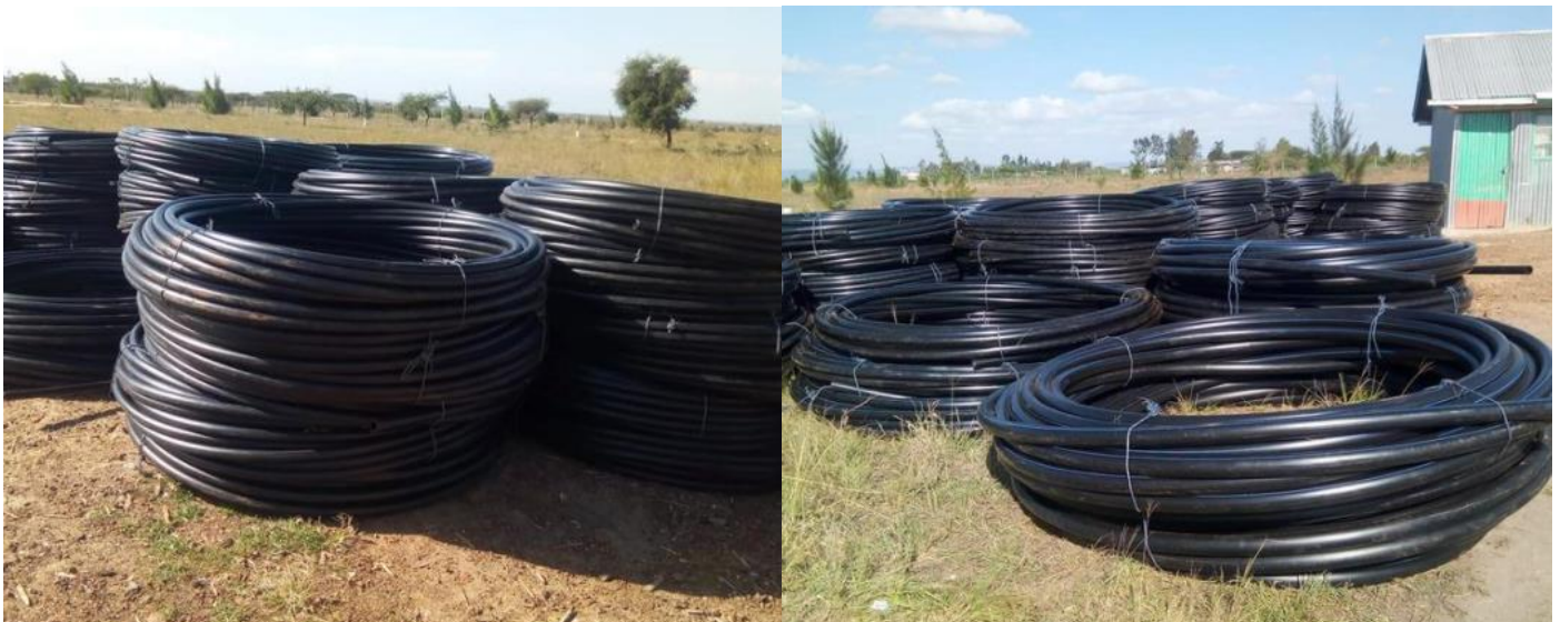
ABOVE: Water pipes arrive on stie to kickstart the installation of water along the mains at the Garden of Joy, Koma on 14/1/2021