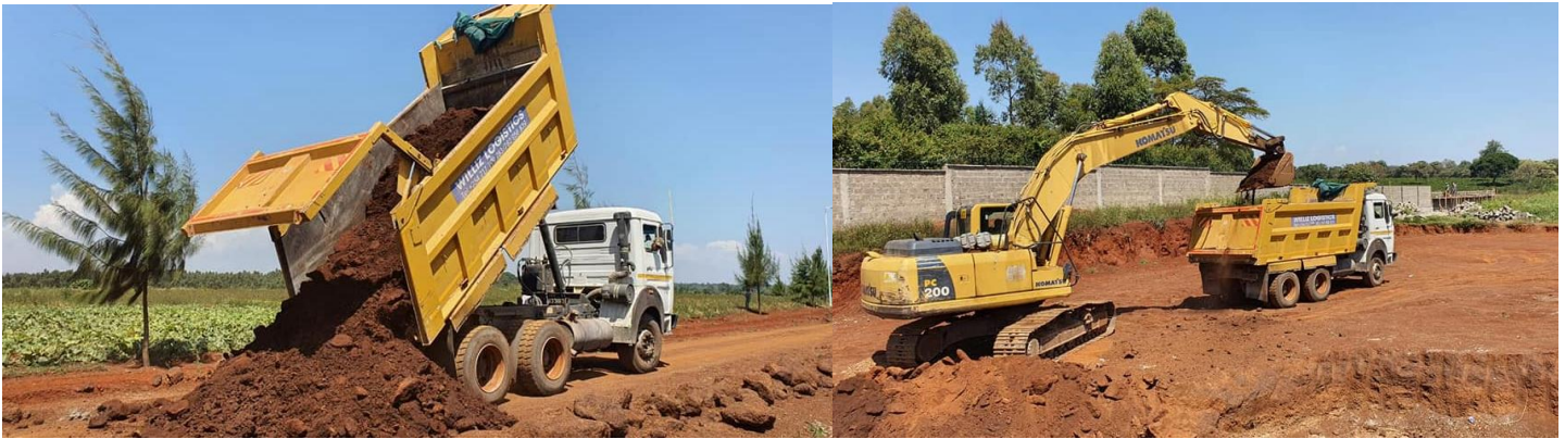
ABOVE: Machinery at work as value addition takes on a new level at AMANI RIDGE | The Place of Peace on 9 th January 2021