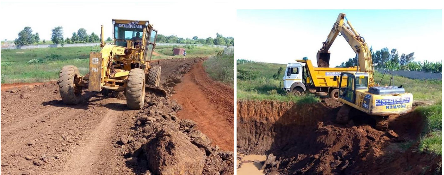
ABOVE: Infrastructure upgrades ongoing on 16/1/2021 as Optiven fast-tracks the value additions at AMANI RIDGE | The Place of Peace, Kiambu