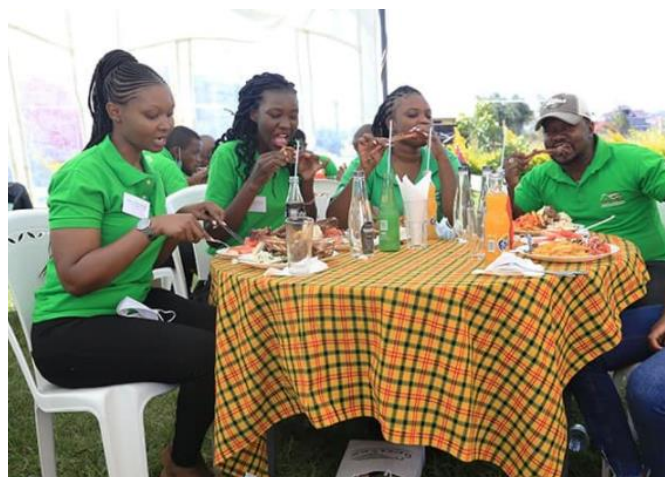
LEFT: The team enjoyed time together with sumptuous meals and at the end of the day, created great memories too.