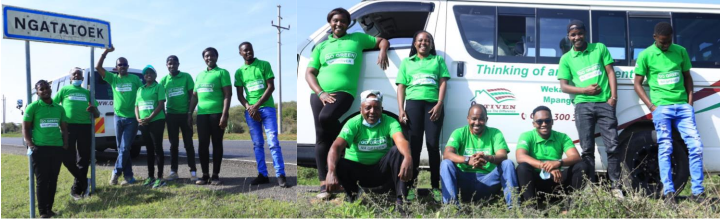
ABOVE: The GreenArmy from Optiven Limited arrives at Ngatatoek, on 21 st January 2021 in time to impact and transform society.