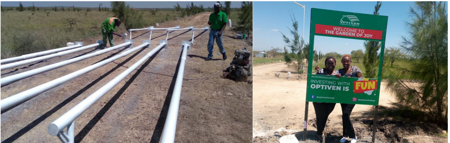
ABOVE: Value addition upgrades at the Garden of Joy by Optiven on 26 th February 2021 as customers enjoy the view on the Koma project.