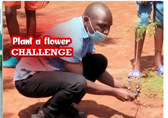
ABOVE: Optiven Real Estate Staff from Digital, Sales, Documentation and Human Resource Departments , join initiatives to Go Green by participating in the Plant-A-Flower Challenge by GMC Place Kitengela in February 2021