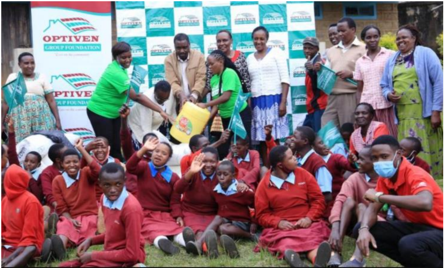
ABOVE: Optiven Foundation joins the community of Don Orione School of Mentally Handicapped on 13/2/2021 to share love with the children.

Apart from tree planting, the Optiven Foundation team also held a mentorship session with the volunteers and workers at the institution on the important role they play as philanthropists to the students. The students interacted with the foundation team in different activities including a fun run. To meet their basic needs, the Optiven Foundation donated different clothing and foodstuffs as part of its health and poverty eradication pillars. As the sunset, the team capped the visit with sharing a Valentine's cake with the children.