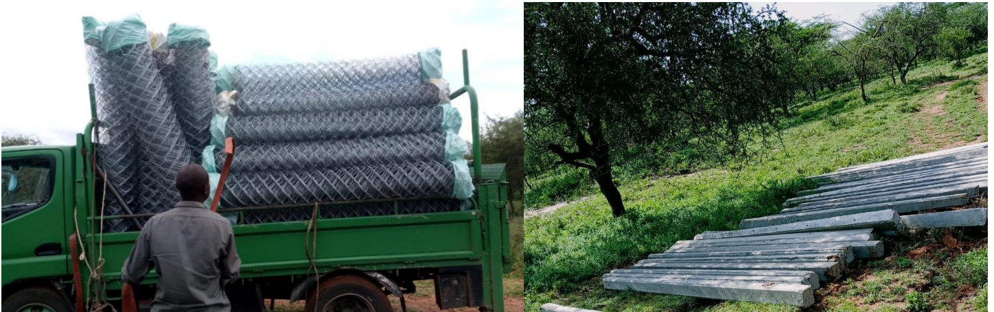
ABOVE: Materials arrive to add value at Love Gardens by Optiven in Kajiado County on 25 th February 2021