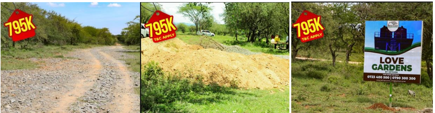
ABOVE: Different sites at Love Gardens by Optiven which has a special offer until 24 th March 2021.