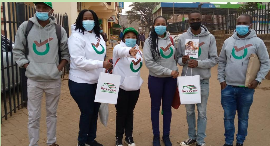
LEFT: Team activating in Thika and reaching customers investing in Success Gardens in Gatanga