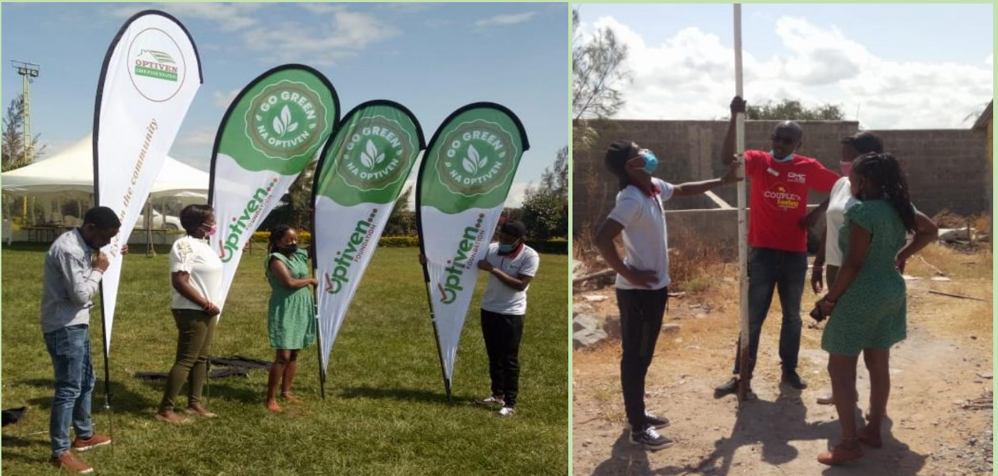
ABOVE: Staff from GMC Place Kitengela, Optiven Group Public Relations and Customer Service, join hands with the Optiven Group Foundation Team to prepare for the launch of the GoGreen Awards 2021 on 22/6/2021 at GMC Place Kitengela