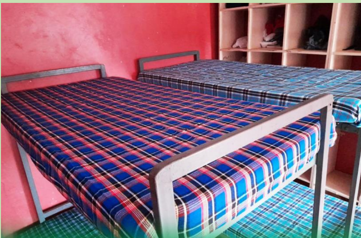
LEFT: New mattresses, blankets and beddings in one of the dormitories at the Flomina Children's Home that were part of donations by the Optiven Foundation in Kayole in July.