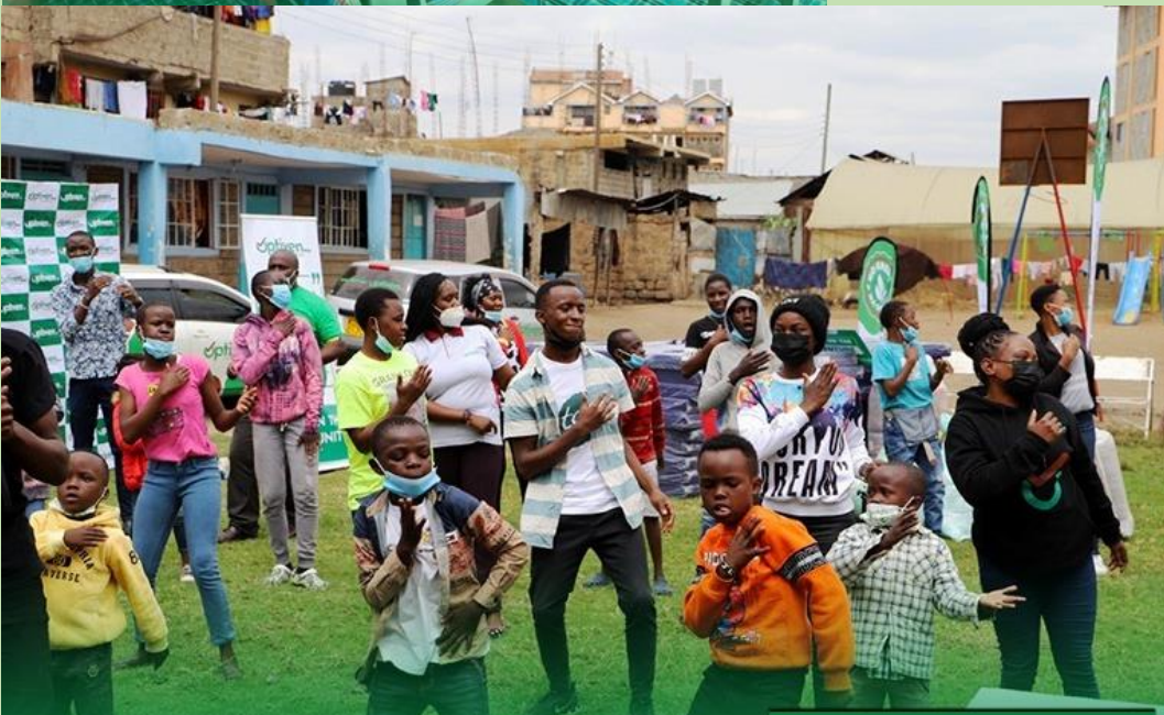
LEFT: The staff from the Optiven Foundation join the community of children at the Flomina Children's Home during the donation of beddings and foodstuff. The event coincided with the commissioning of a solar powered borehole to be sponsored by Optiven Foundation.