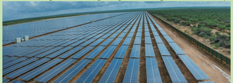
ABOVE: Kenya's largest solar project located in Garissa, North Eastern Kenya.

The largest PV integration project in Africa is set to be carried out in Nigeria following an agreement signed between Onyx Solar, of Spain. According to the agreement, Onyx Solar will install approximately 3,250 crystalline silicon photovoltaic glass spandrels at the Nigerian Bank's new headquarters building that is currently under construction in Lagos. The project will be carried out in partnership with PriVida Power Limited, a Nigerian-based world-class company dedicated to providing affordable renewable energy solutions, to improve the quality of life and sustain the environment. The installation will supply up to 1MWp of installed power, which will substantially reduce greenhouse gas emissions and its ecological footprint. Onyx Solar pointed out that its PV glass has already been installed on many skyscrapers in Singapore, convention centers in Canada, and tourist attractions in Dubai in addition to railway stations in the US, hospitals in Norway, banks in Kenya, embassies in Indonesia, shopping malls in Mexico and universities/colleges in Australia. The Spanish company continues its international expansion in Africa with new photovoltaic integration projects for example the upcoming project at Microsoft's headquarters in the Kenyan capital Nairobi. Owing to this innovative technology, the tech giant takes a step forward to be aligned with the 10 sustainable development goals established by the United Nations.