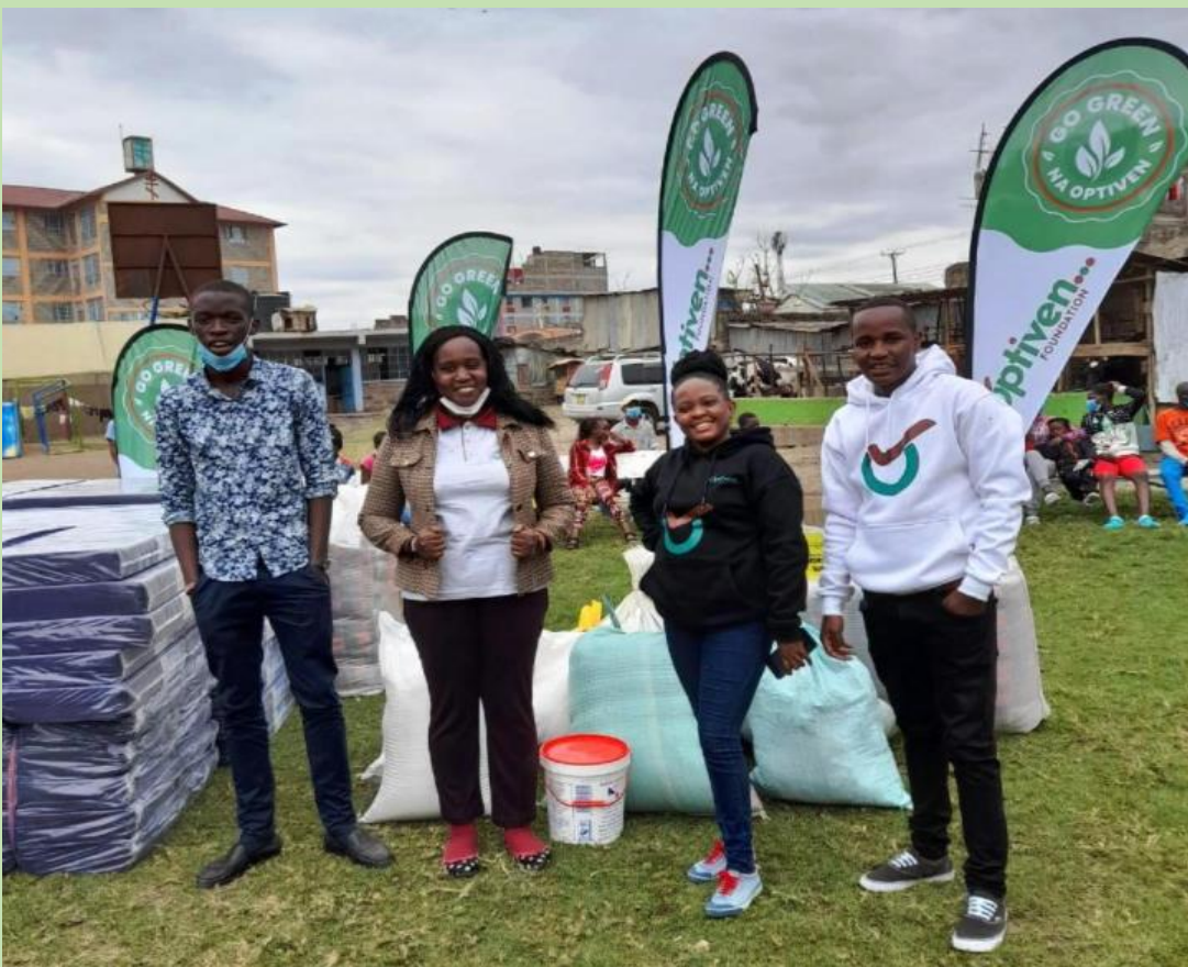
LEFT: Team members of the Optiven Foundation pose with the donations of mattresses, beddings and foodstuffs at Flomina Children's Home in July 2021.

Partner with Optiven Foundation to empower and transform the society