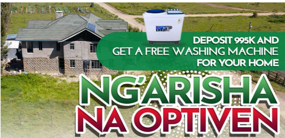
LEFT: The launch poster for the NG'ARISHA NA OPTIVEN Campaign 2021 in August 2021.