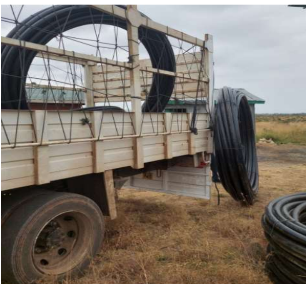
BELOW: Water piping upgrade on 4 th August 2021 at Shalom Gardens by Optiven to facilitate comfort of water access for investors.