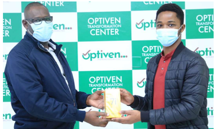
ABOVE and LEFT: Customers collect their gifts from Optiven after making investments in the different projects under the Optiven portfolio.