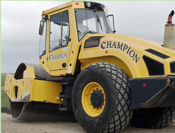
ABOVE: Road grading equipment being used to upgrade the road network at Celebration Gardens on 14 th December 2021, in Kitengela.

The month of December 2021 provided a great opportunity for Optiven Real Estate to add value to one of their newest projects in Kitengela. The month has seen a beehive of activities on 11 th and 14 th of December at Celebration Gardens where murrum compacting took place mainly within the internal roads. The property is located only a few minutes away from the upcoming International Leadership University which saw a ground breaking ceremony done in November 2021. Within the periphery is the Acacia Main Feeder Road that has been proposed for tarmacking. George Wachiuri, CEO, Optiven Group says, “a plot of land is only 1.295 million, and you get to live in an estate that has murrumed roads, trees that will be planted along all internal roads, water on site, fencing, a gate and a care-taker for your security amongst other benefits.”