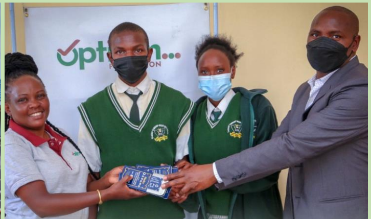
ABOVE: Optiven Group Foundation team members empower candidates of different schools ahead of the 2022 Kenya Certificate of Secondary Education Examinations on 22 nd February 2022. The team donated sanitary pads, geometrical sets and success cards for the candidates.