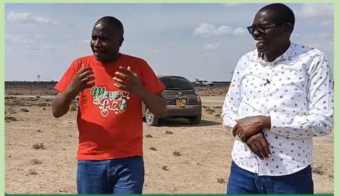
GREAT OASIS NANYUKI DEDICATION