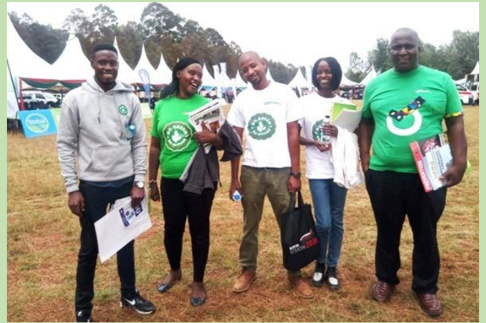
ABOVE: The team representing GoGreen Initiative, joined the rest of the world in marking World Wetlands Day held annually on 2nd February. The event organized by Nature Kenya at Ondiri Swamp in Kikuyu, Kiambu County was under the theme, "Wetlands Action for People and Nature."