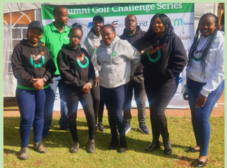
ABOVE: Conversion & Foundation teams at the Sigona on 4/2/2021.

Representatives from the different marketing teams within the Optiven Real Estate army were among exhibitors attending the Alumni Golf Challenge held at the Sigona Golf Club on 4th February 2022. The event was held to encourage alumni of different schools to participate more in their former schools activities while at the same time making a difference in the lives of those students currently studying at the school. The event which attracted a number of top golfers was also an opportunity to empower different golfers on the available products and services under the Optiven Real Estate portfolio. The team also had an opportunity to share what the Optiven Foundation is doing in the education space through it's different initiatives including the Soaring Eagles Scholarship Programme SESP and the George Wachiuri School of Mentorship. Majority of the golfers expressed their confidence in the Optiven brand noting that over the years it had proven itself as a champion in matters real estate, philanthropy and transformation.