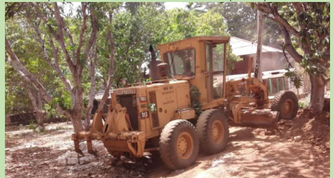
BELOW: Road grading goes a notch higher this February at the Malindi Breeze by Optiven with the exercise to be complete by March 2022.