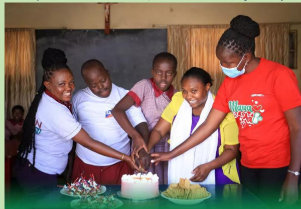
LEFT: Conversion Team ICONS join the Foundation Team during a Valentines visit to St. Maurus Children's Home in Mathare on 14th February 2022