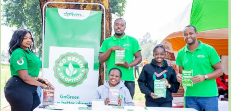
ABOVE: Conversion and Foundation Team members at the Sigona Golf Club on 4/2/2021. The Team empowered the masses on education.