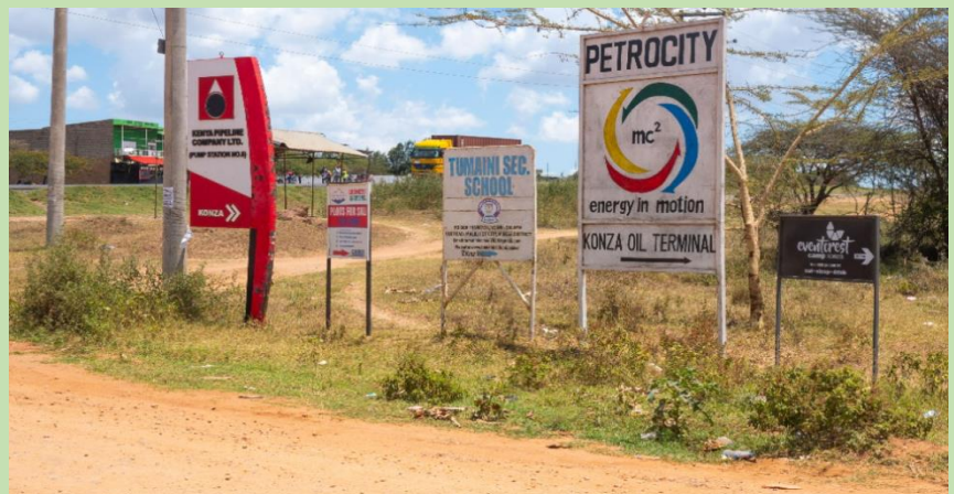
ABOVE: The turn off from the Nairobi to Mombasa Road, that is only 1200 meters to Peace Breeze by Optiven. It leads to the depot for the oil company Petro City.