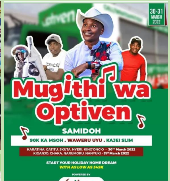
ABOVE: A poster for the event inviting the public to join the Mugithi Team at the different towns in Karatina, Nyeri and Naro Moru