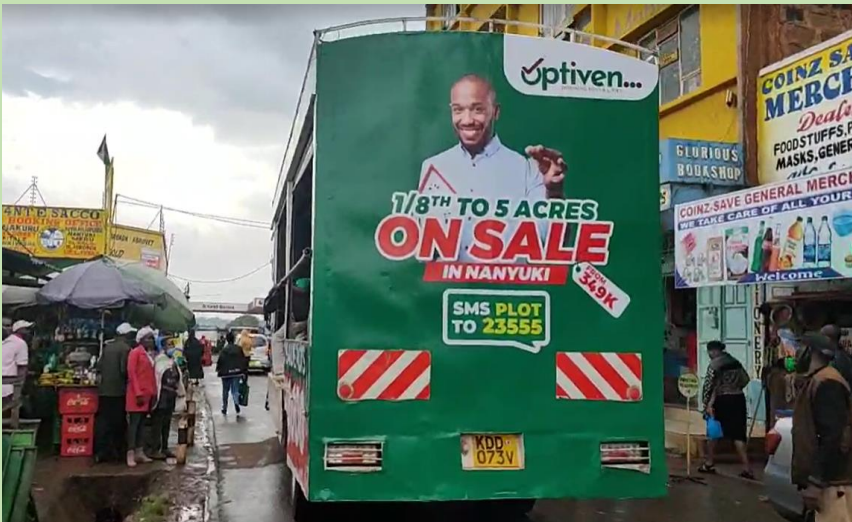
ABOVE: The Caravan on the Optiven Road Show from Nairobi to Nanyuki leaves Skuta heading to Nyeri on 30 th March 2022.