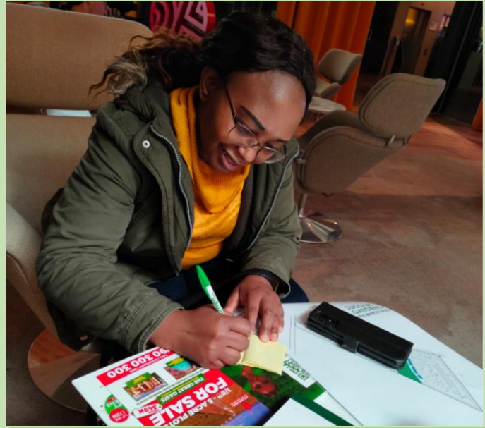
ABOVE: A customer signs her purchase agreement in Berlin on 25 th April 2022 to begin her property ownership journey with Optiven.