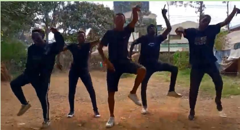
Steppup Dance Crew