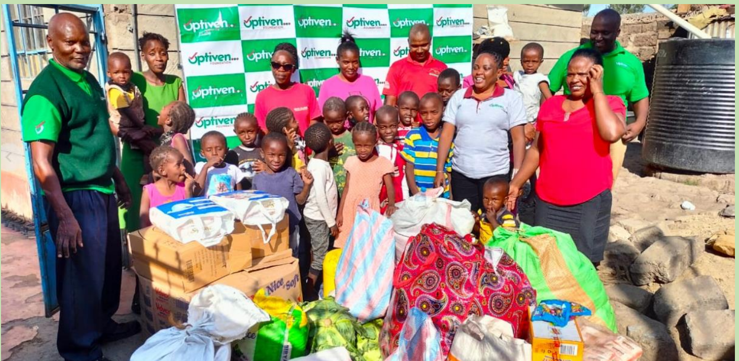
ABOVE: Members of the Optiven Group Foundation together with staff from GMC Place Kitengela donate foodstuff, clothing and sanitary items to the community of Kiota Children's Home in Kamulu, Machakos County on 21 st June 2022.

For more information about GMC Place Kitengela please log on to www.funplace.co.ke