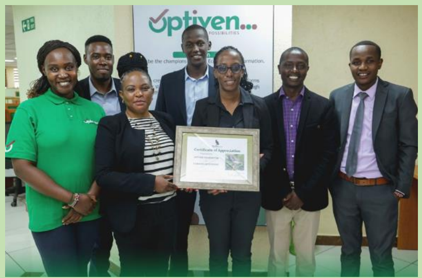
Optiven Foundation under its environment pillar receives a certificate for their role in sustainability from Nature Kenya officials on 6/6/2022.