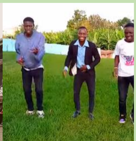
Newbylden dance crew