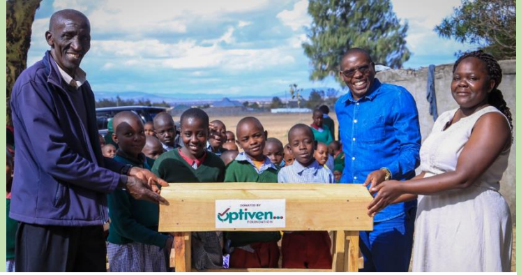
ABOVE: Optiven Group Foundation donated 100 desks pledged to Korrompoi Primary School on 14 th July 2022 under the Education Pillar.