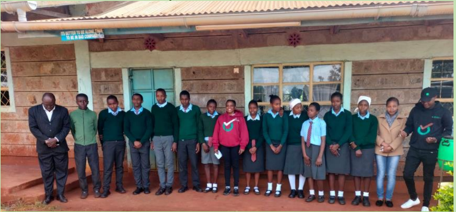
ABOVE: The Optiven Foundation visited beneficiaries of SESP on 28 th July 2022 at Mahutia Secondary School in Murang'a under its Education Pillar.

July began with a unique meeting celebrating a living legend in Bishop William Tuimising. The celebration which was attended by clergy and laymen alike from all walks of life was manifest that Tuimising's 60 years for service this 2022 were not a mirage that fades but instead a clear legacy worth of emulation and celebration. My address to the attendants of that celebration on 5 th July 2022 became an inspiration to me as I thought of legacy and what it would take to have a good one. It brought to mind the joy of being celebrated not just when you are gone but when you are alive and for being a part of the value to society. A legacy is not just the words you say but also the impact of your actions on the generations that come after you. As an entrepreneur, it is the investment you put into the lives of those that trust you with their hard earned money. As a worker, it is the remnant of your income over the years that goes to better your life and those that depend on you. As a parent, it is who your children attribute to you for the impact you have had in their lives. Whichever way you choose to be remembered just make sure it will not be a reason for your turning in the grave or putting tears in the eyes of those who look up to you.