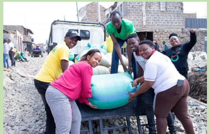
ABOVE: Optiven Foundation donates food to 5 different children's homes under the Poverty Eradication and Health Pillars on July 1 st 2022.