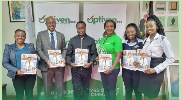
ABOVE: Optiven Foundation team receives a cheque of 150,000/- from Mimshak Spares at Absa Towers on 21 st July 2022 under the Education Pillar.