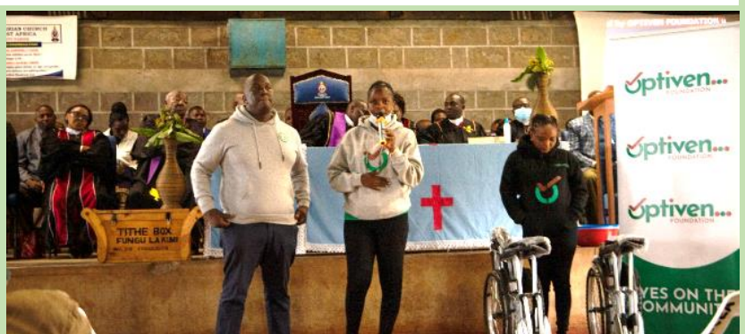
ABOVE: Optiven Foundation donates two wheelchairs to PCEA Charity Church Endarasha on Brothers Keepers Sunday on 17 th July 2022. This is under the Health Pillar.