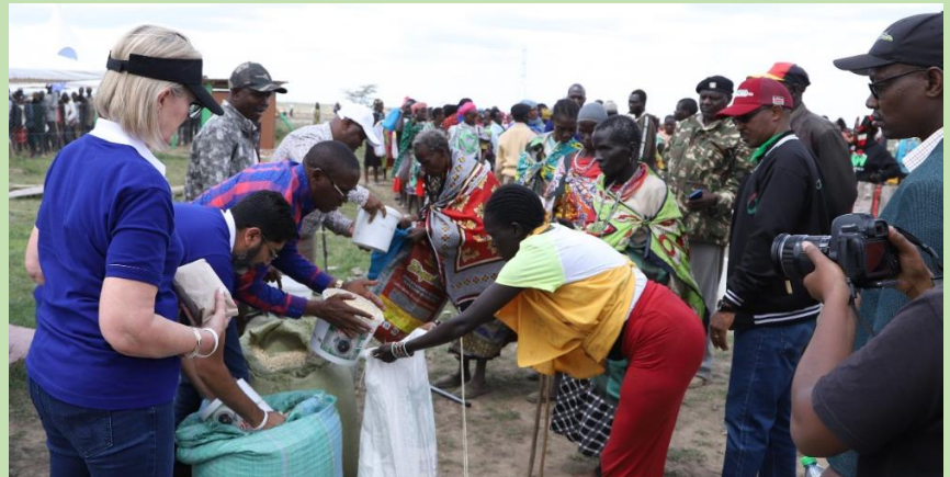
ABOVE: Chief Executives of both Optiven Foundation and Avenue Healthcare take the lead in the food distribution exercise held at the Oasis Gardens by Optiven on 25/11/2022 where over 400 households benefited from the food donation and medical camp.