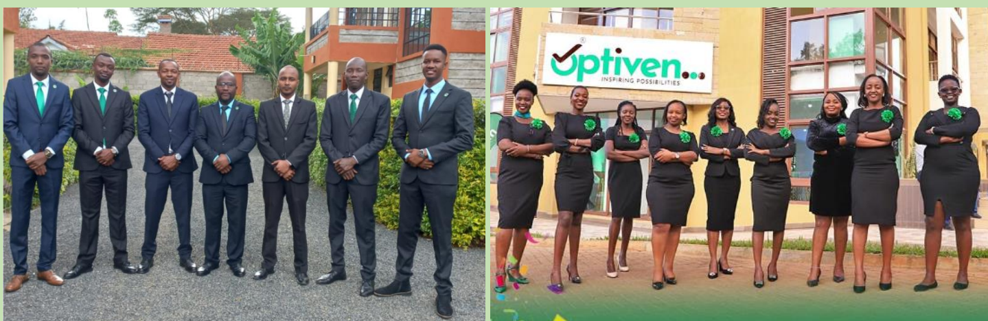
ABOVE: Optiven Conversion Team gentlemen ahead of the Business Community Dinner by Optiven and KNCCI Laikipia Chapter in Nanyuki on 25/11/2022. On the right Conversion Team ladies ahead of the official opening of the Optiven Global office in Karen on 10/11/2022.