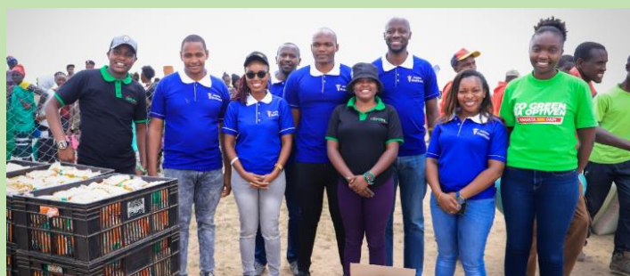
ABOVE: Staff from Optiven Group Foundation and Avenue Healthcare pose for a photo at the beginning of the food donation and medical camp in Tutu Constituency on 25/11/2022.

To this end we welcome you too to partner with the Optiven Foundation and join our initiatives to benefit various communities as we transform the lives of the needy in our society.