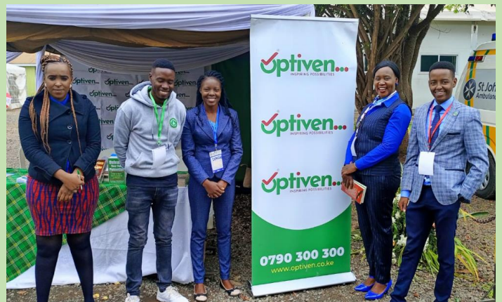
ABOVE: Team Sharks at the Strathmore University Alumni Breakfast on 18/11/2022. On the left, Team GLS Nairobi at CITAM Karen on 4/11/2022