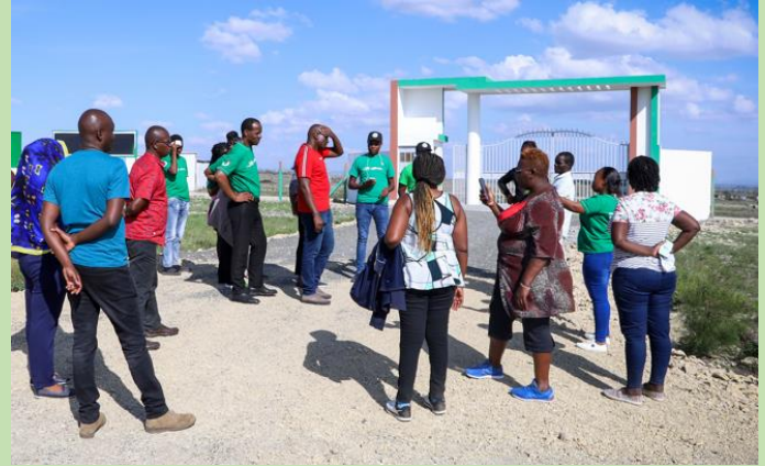
ABOVE: Optiven TeamAfrica members empower investors during the Diaspora Investors Bus Tour by Optiven to Happy Gardens on 18/12/2022.