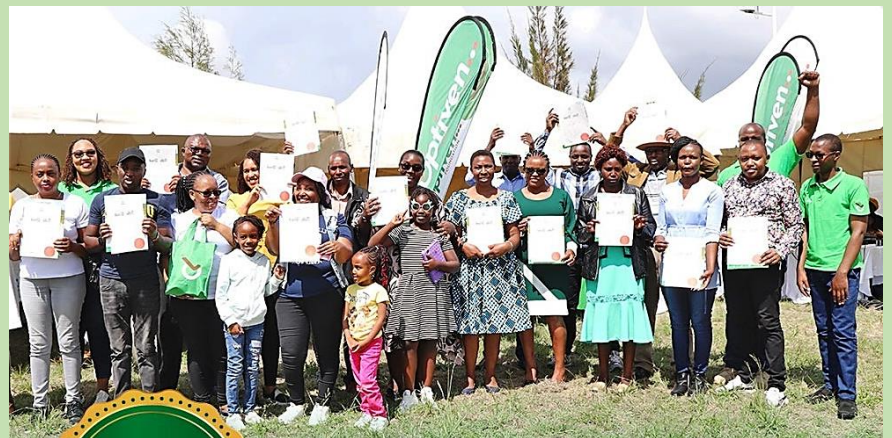
ABOVE: 20 winners in the 60 Days of Christmas with Tusky's campaign, pose with their title deeds at the Garden of Joy by Optiven where their plots are located. The event was to honor a partnership entered into in 2019 between Tusky's Supermarkets and Optiven

dream homes owing to the transformation of the project. At the Garden of Joy, it is clear that the project is the choice home for many owing to the vast installation of solar street lights, a beautiful gate, a perimeter fence, water and electricity on site, and of course fully grown trees that mark the individually beaconed plots across the project. The title deed event is one among over 12 others held by Optiven across the country to enable customers who have invested in different projects to take full ownership of their properties. Optiven, has spread its wings further by ensuring that even investors in the diaspora continue to empower customers first to own land and secondly to seal the engagement by ensuring they get a title deed for their investment with Optiven. Wachiuri says this is a part of the company's culture to keep its promise to those that have trusted the Optiven brand to invest in land and receive the title deed as proof of ownership. The initiative to bestow title deeds to customers who have completed their payments continued beyond the borders with different investors of different projects receiving their document of ownership in countries such as Finland, America, Japan and the United Kingdom.