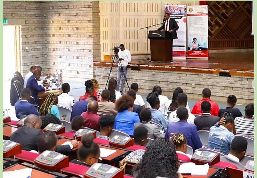
ABOVE: Part of the participants at the CUEA where students from different universities gathered to be empowered as members of the Kenya Economics Students Association.

In the month of February 2023, I had the rear privilege of being able to meet up with a number of youth that I have