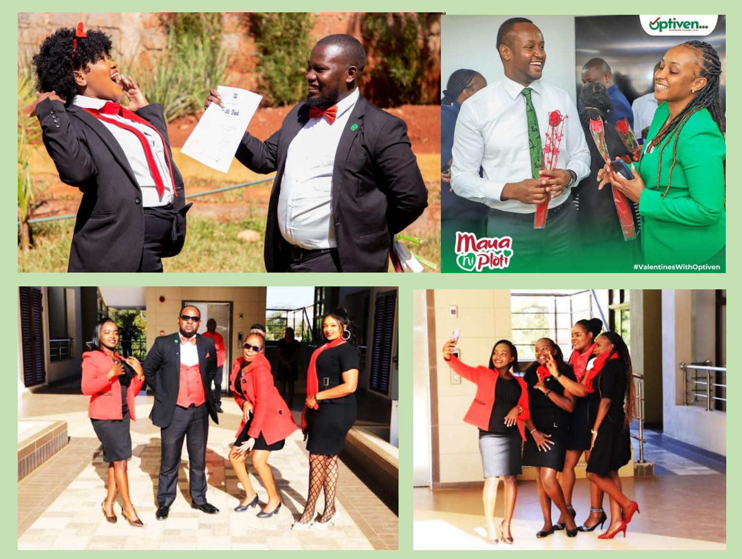
ABOVE: In the month of Love, the Optiven staff at Karen Global and Kenya Office were not left behind as they celebrated the day with our customers under the #MauaNiPloti Campaign, on 14<sup>th</sup> February 2023.