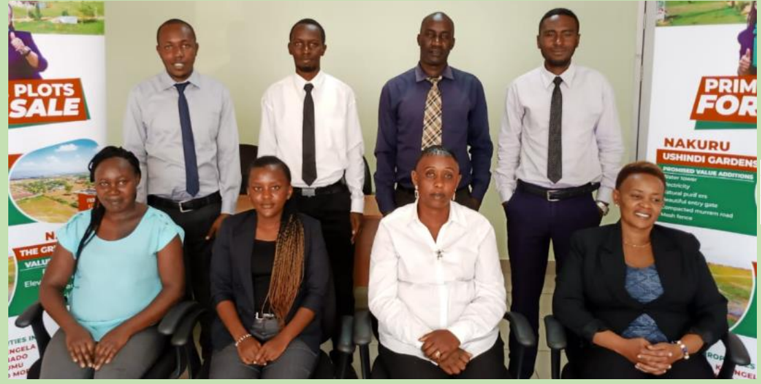
LEFT: Rich Valley Team Members representing Optiven Nakuru at their offices on 27/2/2023