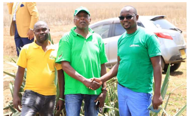
ABOVE: Our pillars at Ushindi Gardens on 17/4/2023