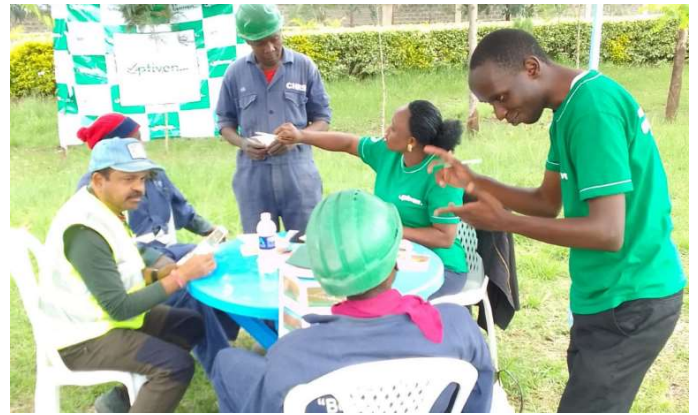
ABOVE: #TeamNakuru at Simba Cement on 26/4/2023