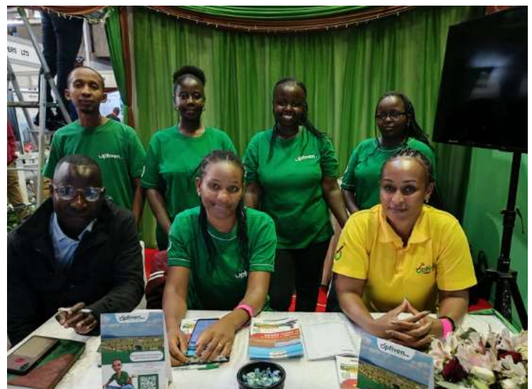
LEFT: Optiven Conversion Team attend to customers on 15th April 2023 at the HOMES EXPO. ABOVE: Karen and Absa Teams ready to empower at the HOMES EXPO