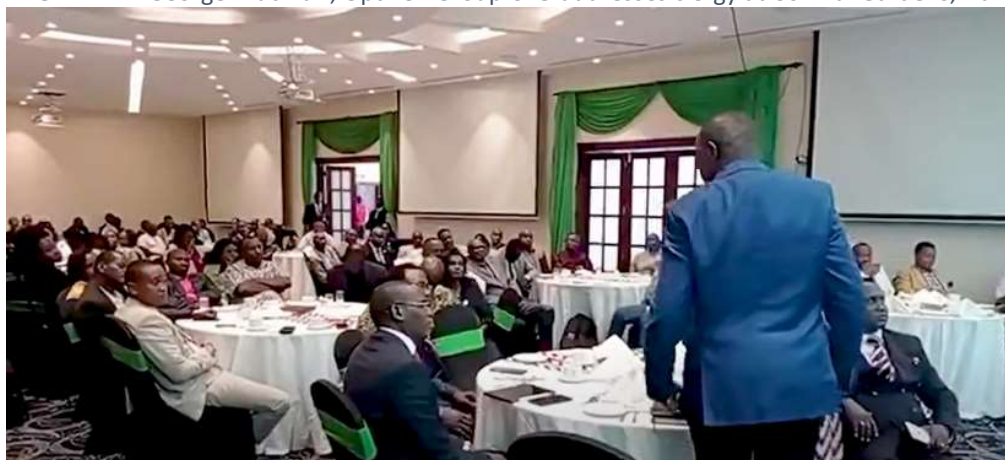
LEFT: Clergy from different churches attend the Nakuru Clergy Breakfast courtesy of Optiven on 17/4/2023 at Sarova Woodlands.