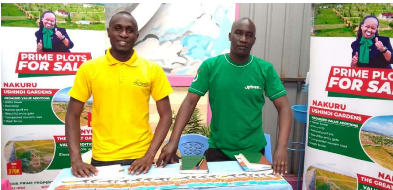
LEFT: #TeamNakuru were at Mountain of Glory Church on 23/4/2023