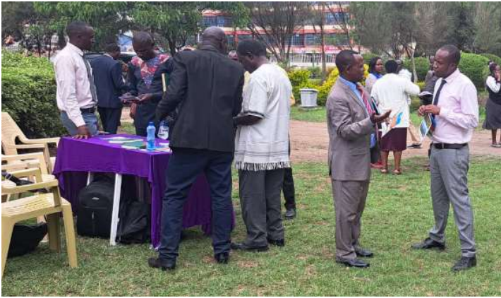
LEFT: #TeamNakuru on 18/4/2023 were at KAG Nakuru