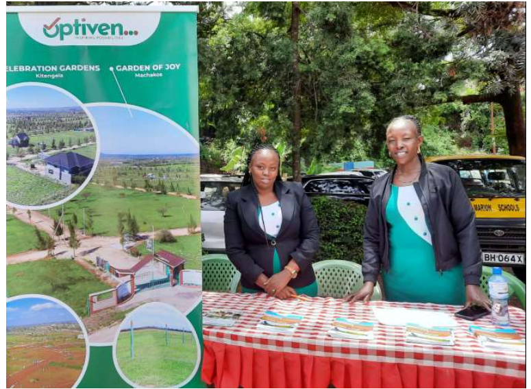
ABOVE: #TeamAbsa empowering at the Marion Group of Schools Thanksgiving on 21/4/2023