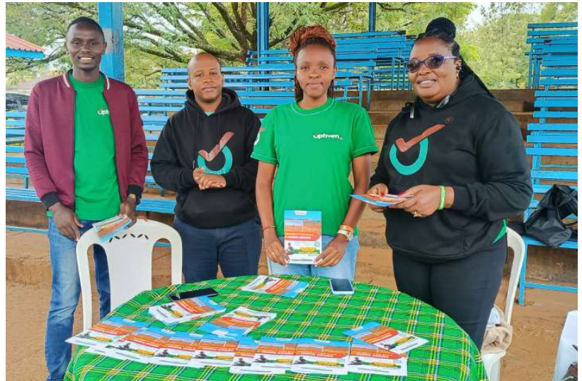
ABOVE: #TeamAbsa was present to represent the brand fully at Hospital Hill School Prize Giving Day on 14/4/2023