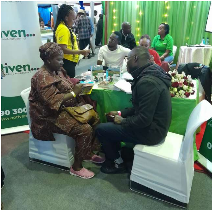
ABOVE RIGHT: Optiven Conversion Team ready to empower at the Homes Expo on 14th April 2023