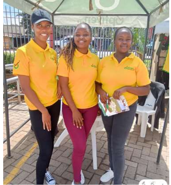
ABOVE: #TeamNanyuki represented Optiven at Nanyuki TRE Networking Breakfast at Nanyuki Golf Club on 1/4/2023 and the team members activate at Cedar Mall in Nanyuki on 28/4/2023