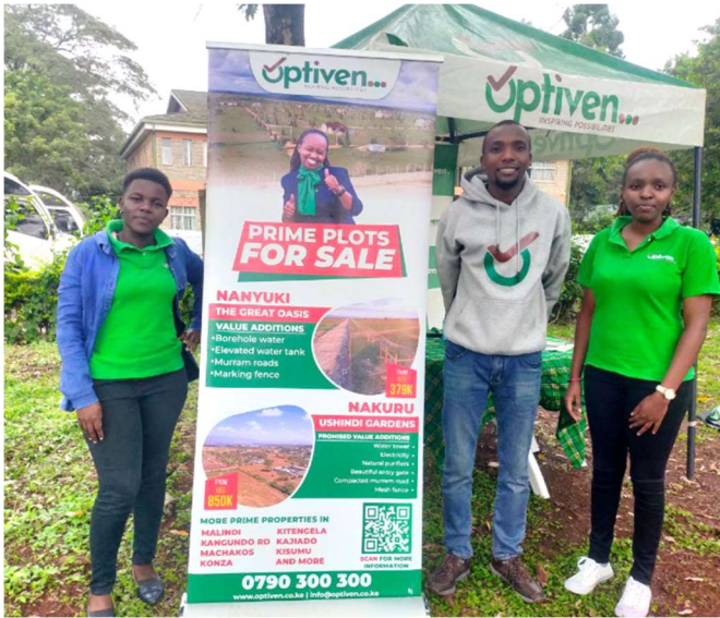
ABOVE: #TeamAbsa empowering at the Kenya Forest Service on 25/4/2023