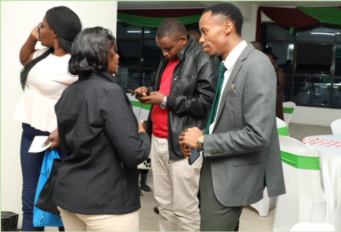
LEFT: #TeamNakuru hosted investors ON 23/6/2023 at the first Coffee over Investment with investors turning up in large numbers.