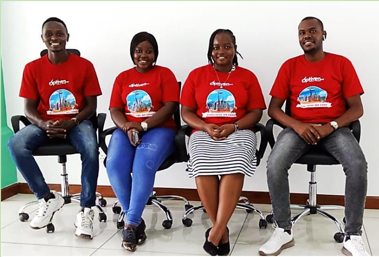
ABOVE: OPTIVEN STAFF serving at the Optiven Mtwapa Office after reporting this June 2023 at their offices on 2 nd floor, Shifa Archade, Mtwapa, Kilifi

Optiven Limited continues to make a difference and inspire possibilities in the coastal region. This June, the decision to open a new office aligns with Sustainable Development Goal number 7 focusing on promoting inclusive and sustainable economic growth, productive employment and decent work for all. The new office is located on Shifa Arcade on the second floor in Mtwapa, Kilifi county. By establishing presence in Mtwapa and launching the Ocean View Ridge project, Optiven Limited is not only contributing to economic growth in the region but also creating job opportunities for local communities. The presence of a local office allows for more convenient access to information, sales inquiries, customer support and other services related to our newest project - Ocean View Ridge, Vipingo and Malindi Gardens Phase 5, Baolala.