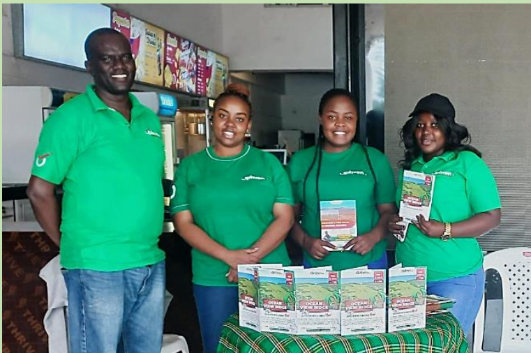
ABOVE: #TeamGlobal empowers Nyalı on 30 th June 2023.