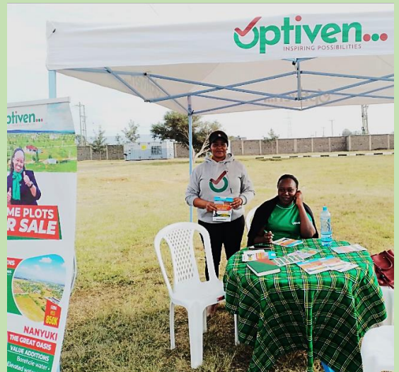
ABOVE: #TeamNakuru was transforming lives at the Kenya Pipeline Company in Nakuru on 22/6/2023