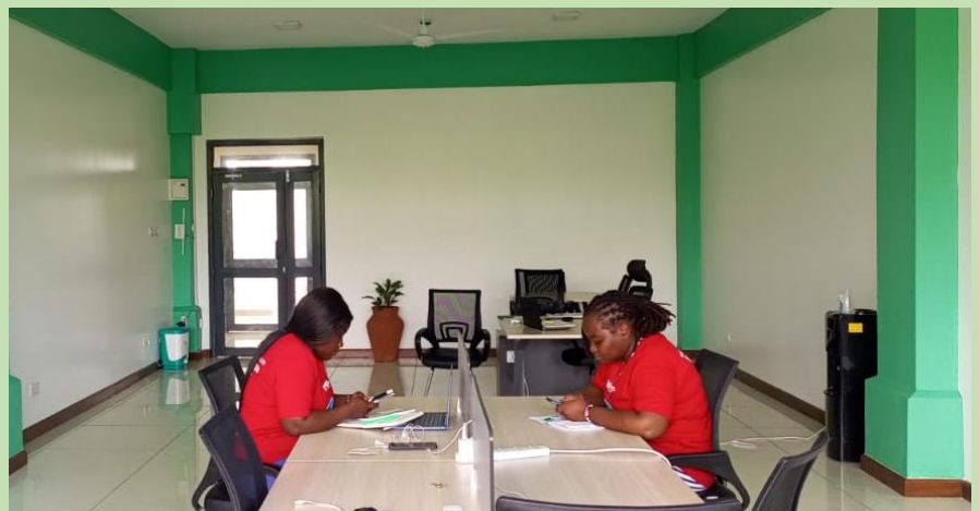
ABOVE: OPTIVEN STAFF serving at the Optiven Mtwapa Office after reporting this June 2023 at their offices on 2 nd floor, Shifa Archade, Mtwapa, Kilifi