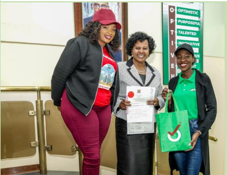
ABOVE: #TeamGlobal hosted a customer from the USA as she picked her title deed on 30 th June 2023