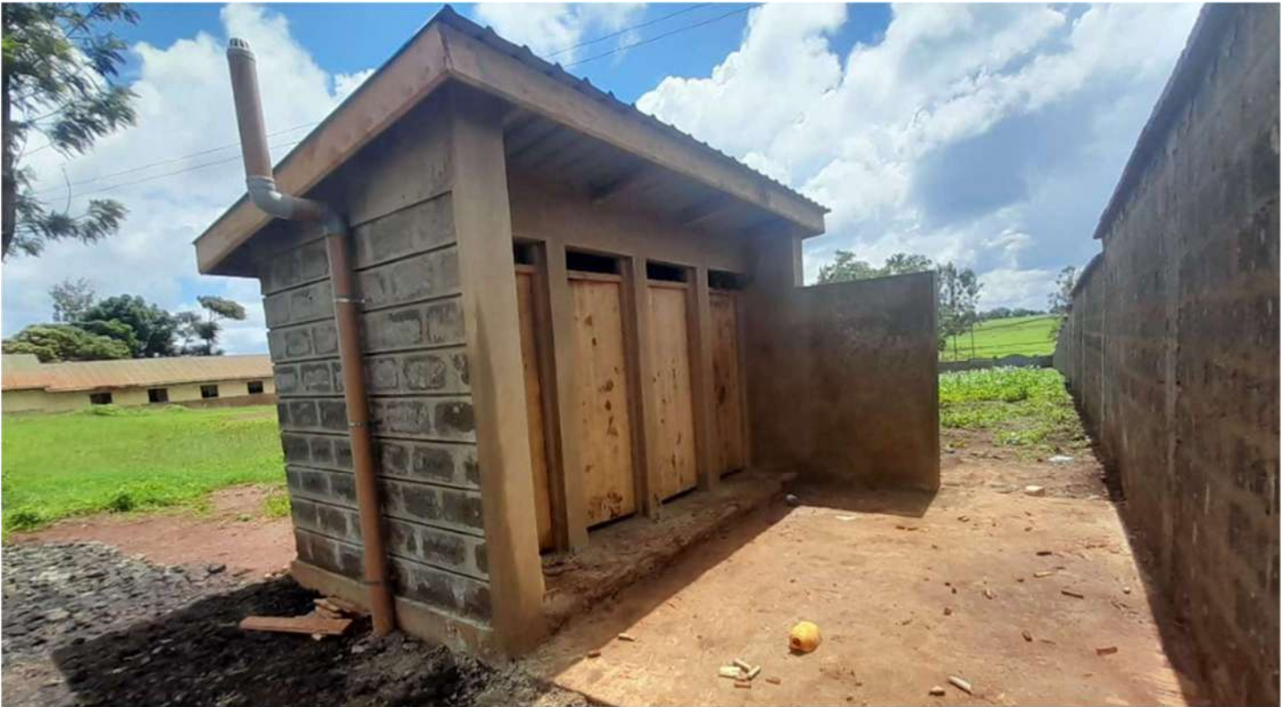
ABOVE: The toilet block donated by Optiven through its Go Green Initiative under construction at Kiama Primary School on 18th November 2023

Optiven through its philanthropic arm, the Optiven Foundation has donated a toilet block that will benefit the community at Kiama Primary School. The school which is adjacent to the Success Gardens project by Optiven has been in need of the ablution block and with the development, the school community is better placed to manage its human waste. The contractors are on course to deliver the building not later than November 30th 2023.