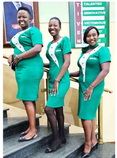
ABOVE: Optiven #TeamDiaspora representing Europe, America, Asia and the Middle East.

ARE YOU IN THE DIASPORA? Talk to OPTIVEN DIASPORA about investments in real estate. Our offices are located on 2 nd floor of Absa Towers, Loita Street Nairobi, +254 796 000333 globalmarkets@optiven.co.ke inspiring diaspora