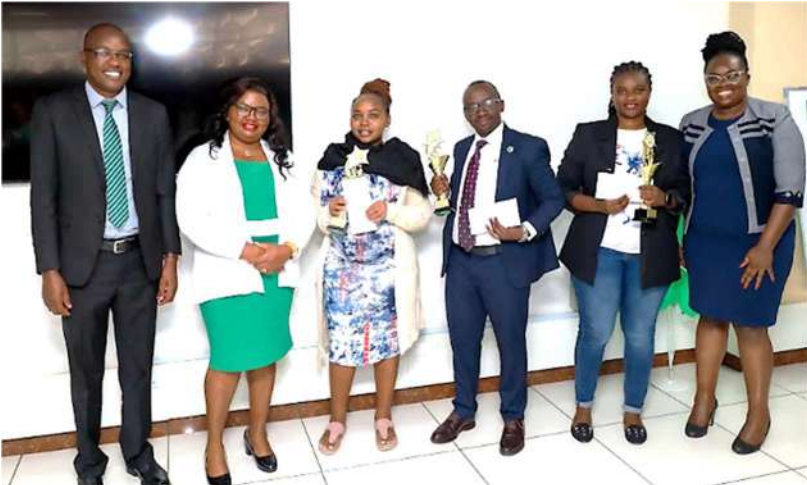
ABOVE: Staff in ICT, Media and Digital Departments, accompanied by their Team Leaders, were recognised with awards on 14/11/2023 for their excellence in innovation which is one of the values at Optiven. This was part of celebrations to mark 24 Years of Optiven in November 2023.