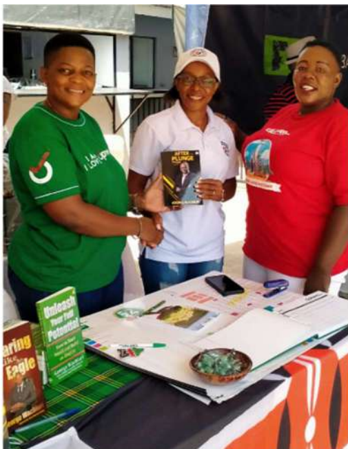
ABOVE: Optiven #TeamAfrica were in Kampala Uganda this November to empower Kenyans.