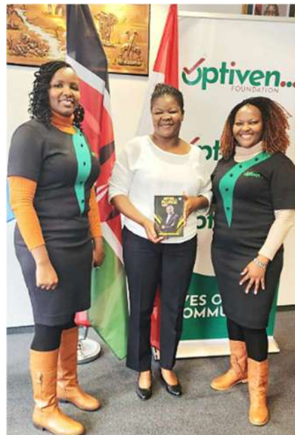
ABOVE: Optiven #TeamEurope visited the Embassy Vienna Austria 22/11/2023.