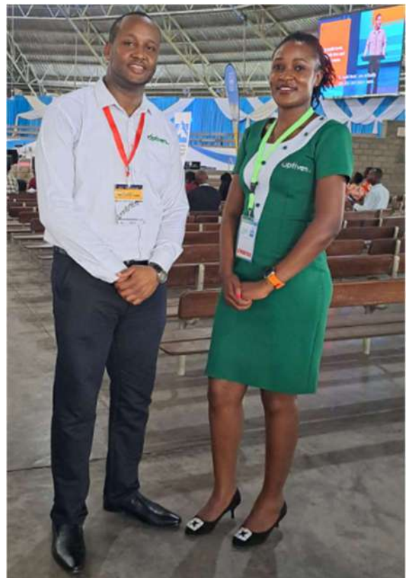
ABOVE: The Optiven Team was present at the Nairobi and Mombasa GLS Summit in November.

Last but not least, we are humbled to have done a better deed to the planet by growing trees at two of our gem projects – Kithimani Springs and Ushindi Gardens respectively. Indeed, we keep the focus through inspiring possibilities.