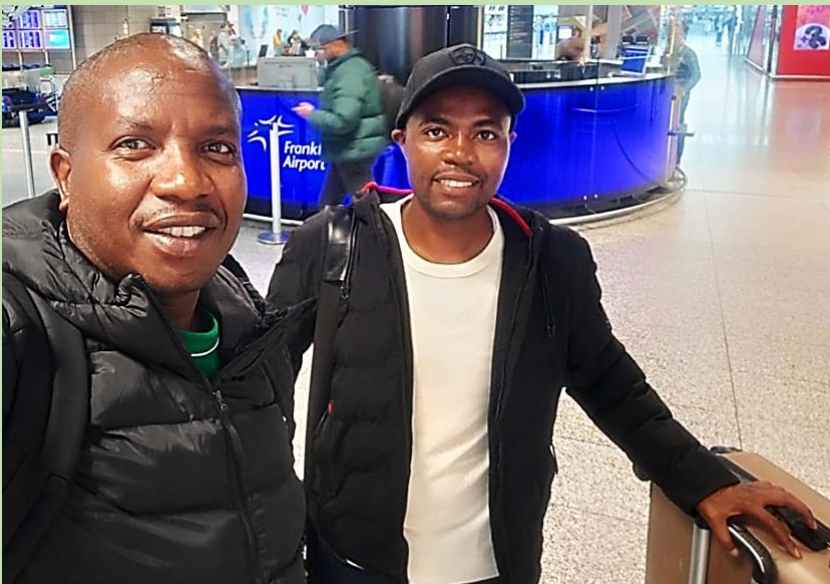
ABOVE: Optiven Diaspora team members representing Europe, arrived in Frankfurt Germany on 16/2/2024 to deliver the Optiven promise to investors.