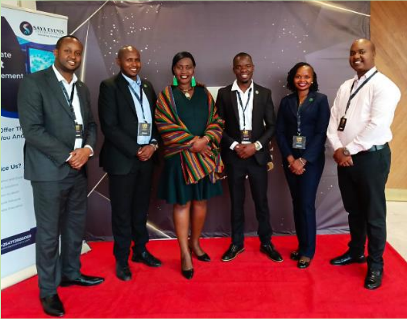
ABOVE: Optiven Diaspora team members representing Saudi Arabia, Yemen, Kuwait and UAE attended the CEO;s Conclave Dinner at Ole Sereni Hotel on 1/2/2024.