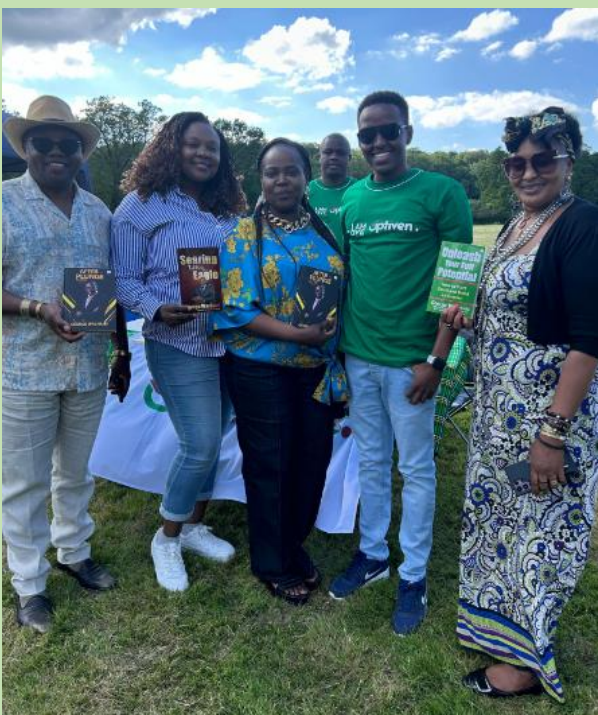
ABOVE: #TeamEurope were at hand to serve Kenyans living and working in different cities in the United Kingdom in June.

#TeamAsia completed their trip with a powerful engagement of Kenyans in the UAE. The team had been in the GCC nations of Qatar and Dubai since May 2024. It was the third trip for the team which