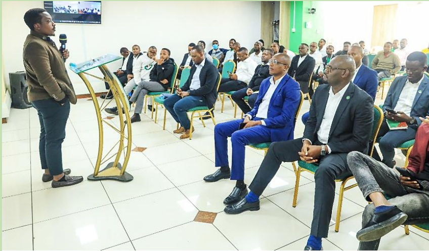
ABOVE: Motivational Speaker and Guru on Men's Health from Avenue Hospital speaks to Optiven male staff on 11 th June 2024 at the Absa Offices as part of activities marking Men's Mental Health Month.

June is men's mental health month and Father's Day is also celebrated on the third Sunday. The former is meant to create awareness on the unique mental health challenges that men face and honoring the contributions of fathers and father figures. In that spirit, Optiven was at the forefront of acknowledging and celebrating the vital contributions by men within the organization. Thus the month was marked by a series of events celebrating these notable achievements of men.