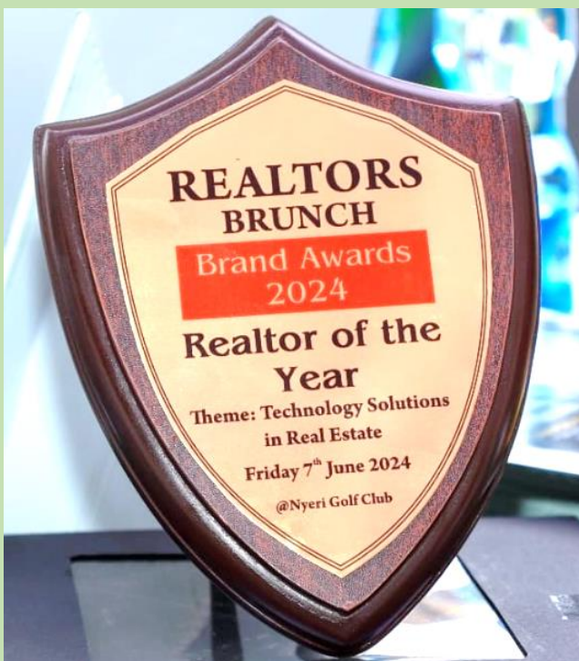
ABOVE: The award bequeathed to Optiven Limited as the Realtor of the Year at the Brand Awards 2024 held at the Nyeri Golf Club

Over the past year Optiven has launched new distinctive projects with the client in mind, including the recently launched Hekima Gardens phase 4 in Nyeri County which was acknowledged for its unique lifestyle and sustainable features.