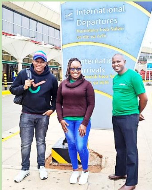
ABOVE: Optiven's #TeamAfrica at the JKIA Airport in June 2023 before departing to Lusaka, Zambia

The land of the legendary African walking safari, Victoria Falls, the wild Zambezi River, abundant wildlife and untamed wilderness – all in one friendly country. Blessed with awe-inspiring natural wonders, a plethora of wildlife, huge bodies of water and vast open spaces, welcome to Zambia. And Optiven this August landed in this jewel of Africa