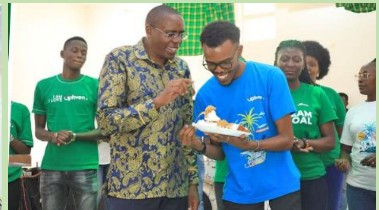
Members of staff had an opportunity to shake a leg, do a skit, dance and have fun as January babies were celebrated with a customized cake just for them.