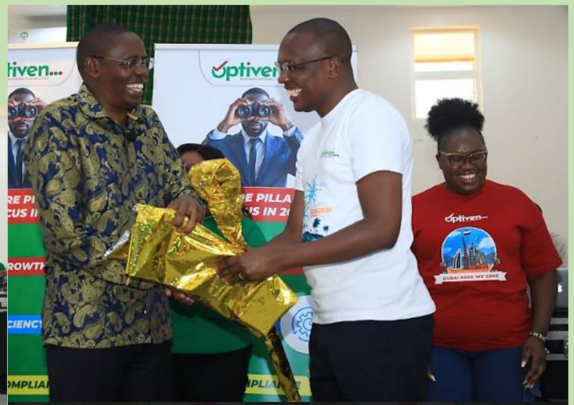
It was also an opportunity for the Directors to be gifted and the honors was done by the Associate Directors