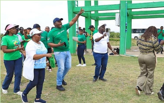
ABOVE: Optiven leadership celebrates customers who received their title deeds at the Great Oasis Gardens on 1/9/2025 in Nanyuki.

1/10/2025 || OPTIVEN CUSTOMERS AT GREAT OASIS GARDENS RECEIVE TITLE DEEDS.