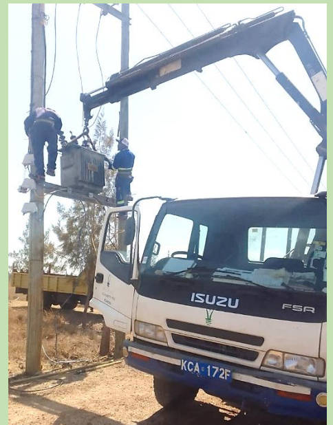
RIGHT: Engineers from Kenya Power install electricity at Shalom Gardens by Optiven on 1/10/2025.

3/10/2025 || VALUE ADDITION ON ROADS AT CELEBRATION GARDENS