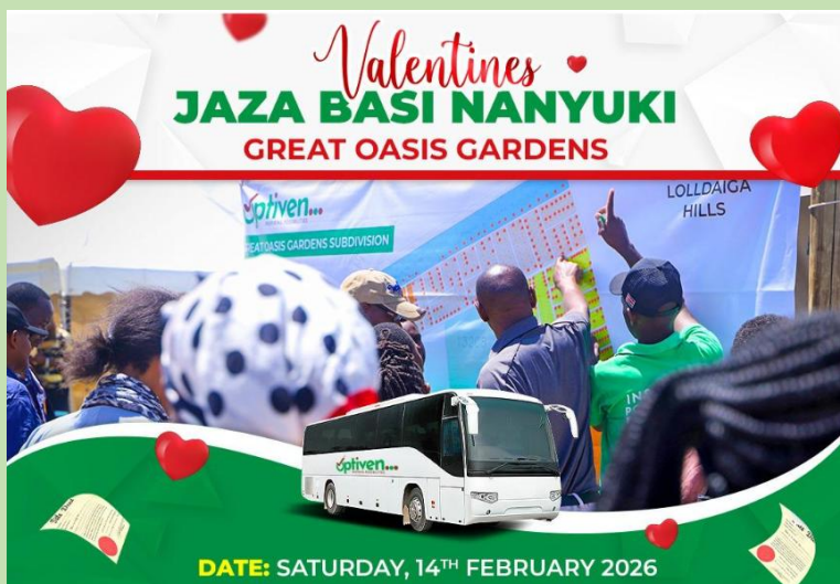
ABOVE: A campaign poster advertising the Valentine site visit to the Great Oasis Gardens in Nanyuki on 14/2/2026.

In Nanyuki, investors had a great time getting to know the project as they took time to visit the Great Oasis Gardens by