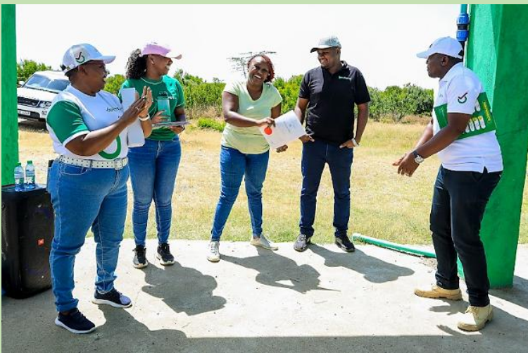
ABOVE: Optiven's Managers and Staff celebrate with customers who received their title deeds at The Great Oasis Gardens Nanyuki on 24/1/2026.