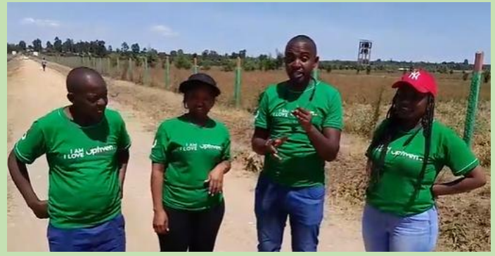
ABOVE: Optiven's Senior Sales & Marketing Managers were on ground at Ushindi Gardens by Optiven in Nakuru on 21/1/2026.