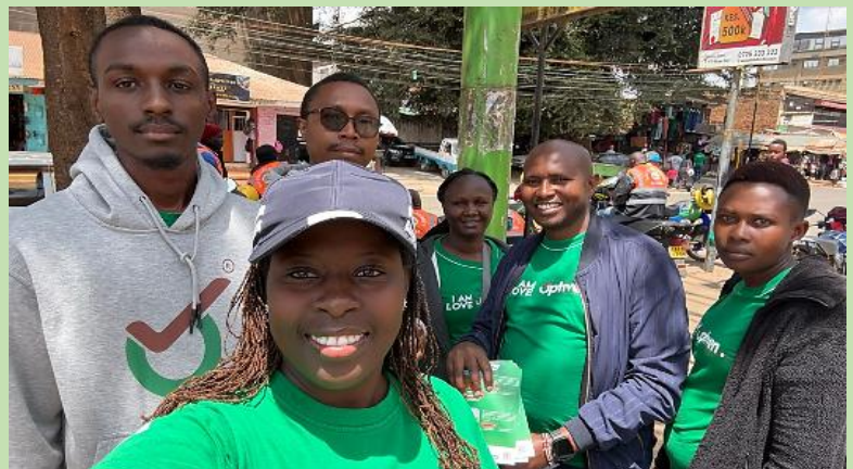
ABOVE: Optiven Sales Champions on ground in Kikuyu Town on 27/1/2026.