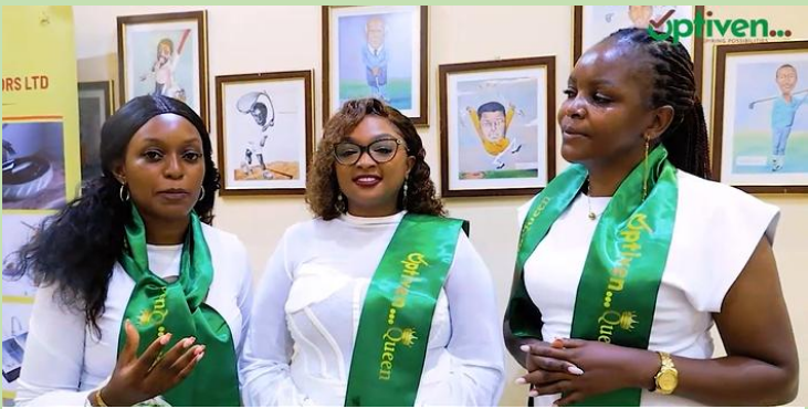
ABOVE: Optiven's Senior Sales & Marketing Managers attend prize giving at the Lady's Captain Golf tourney, Nyali Golf Country Club on 17/1/2026