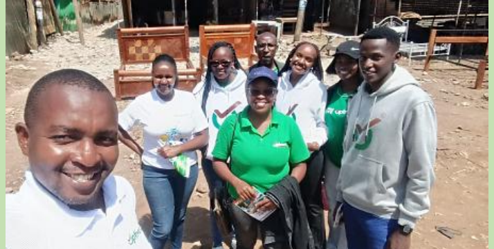
ABOVE: Optiven Sales Champions on ground at Ngong Rd on 27/1/2026.