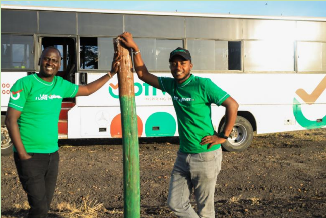
ABOVE: Project Champions were at Peace Breeze on 23/1/2026.