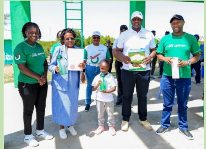
ABOVE: Optiven's Managers and Staff celebrate with customers who received their title deeds at The Great Oasis Gardens Nanyuki on 24/1/2026.